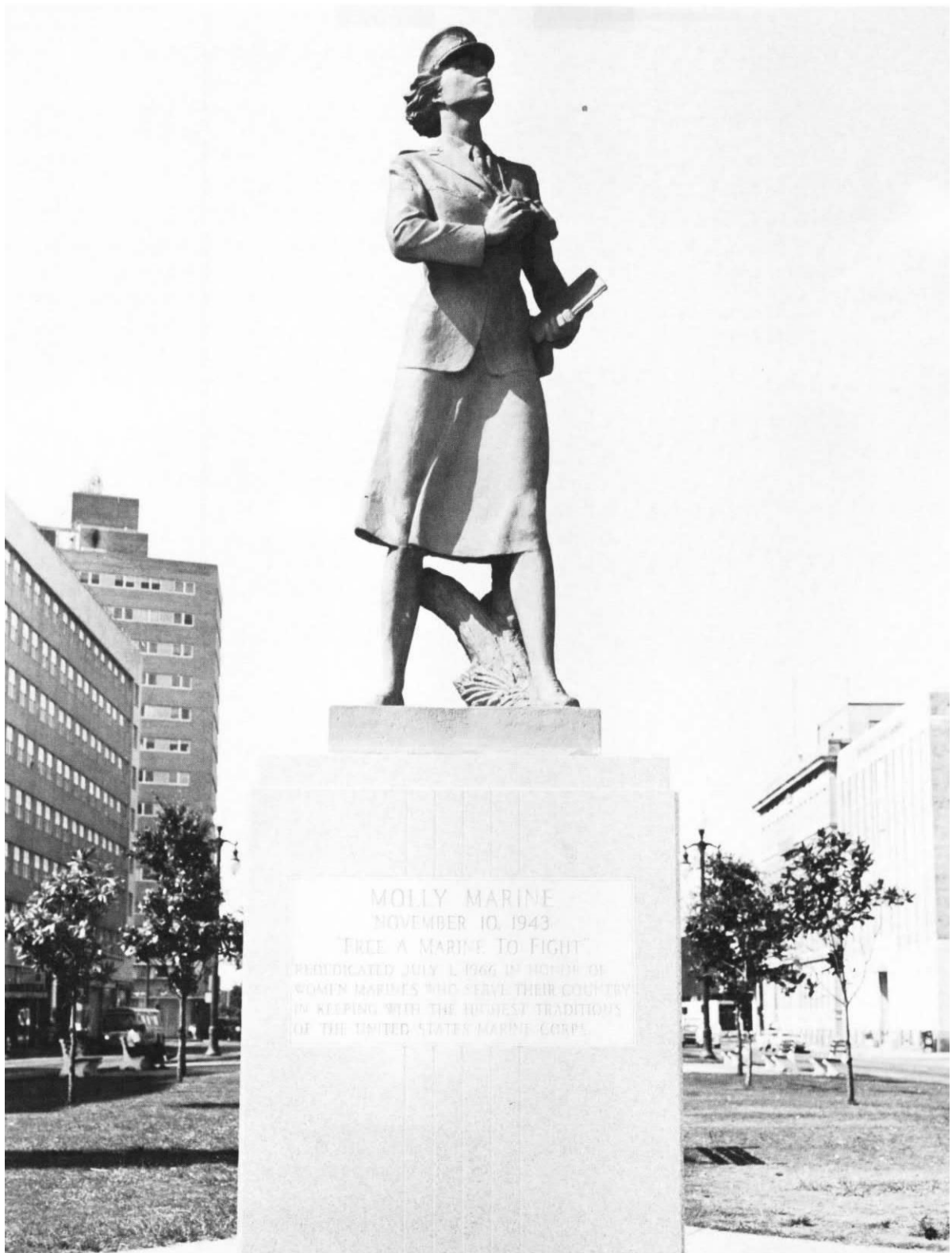
Molly Marine, monument in New Orleans, dedicated to women who served as Marines.