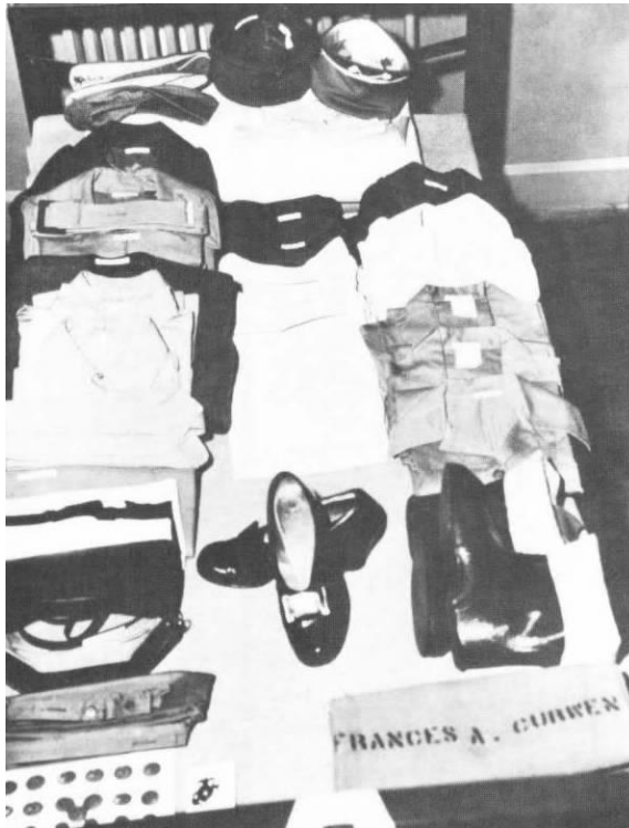
Issued uniform items and gear, cleaned, ironed, and labeled are displayed according to regulations for a "junk on the bunk" inspection in the early 1950s.

over the left shoulder, leaving the right arm free to salute, and until 1952 the strap could be worn either over or under the epaulets of coats. A green cover and strap were added for wear with the summer service and summer dress uniforms.