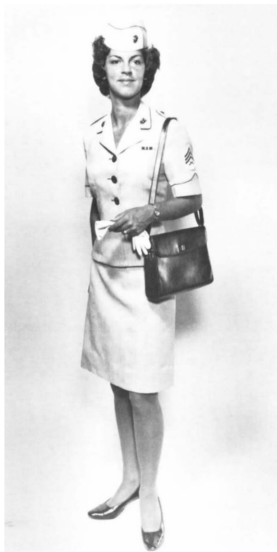
The green and white striped two-piece summer service dacron uniform with black handbag and pumps was worn by officers and enlisted women in the 1970s.

Hem lengths: The style of the uniform was able to withstand fashion changes from 1952 to 1977, but hem lengths were as controversial for servicewomen as civilians. When the Mainbocher wardrobe was issued, the regulations specified that skirts would be of a conventional sweep and length, approximately mid-calf.