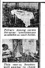
Private dining room for your entertaining at each hotel.