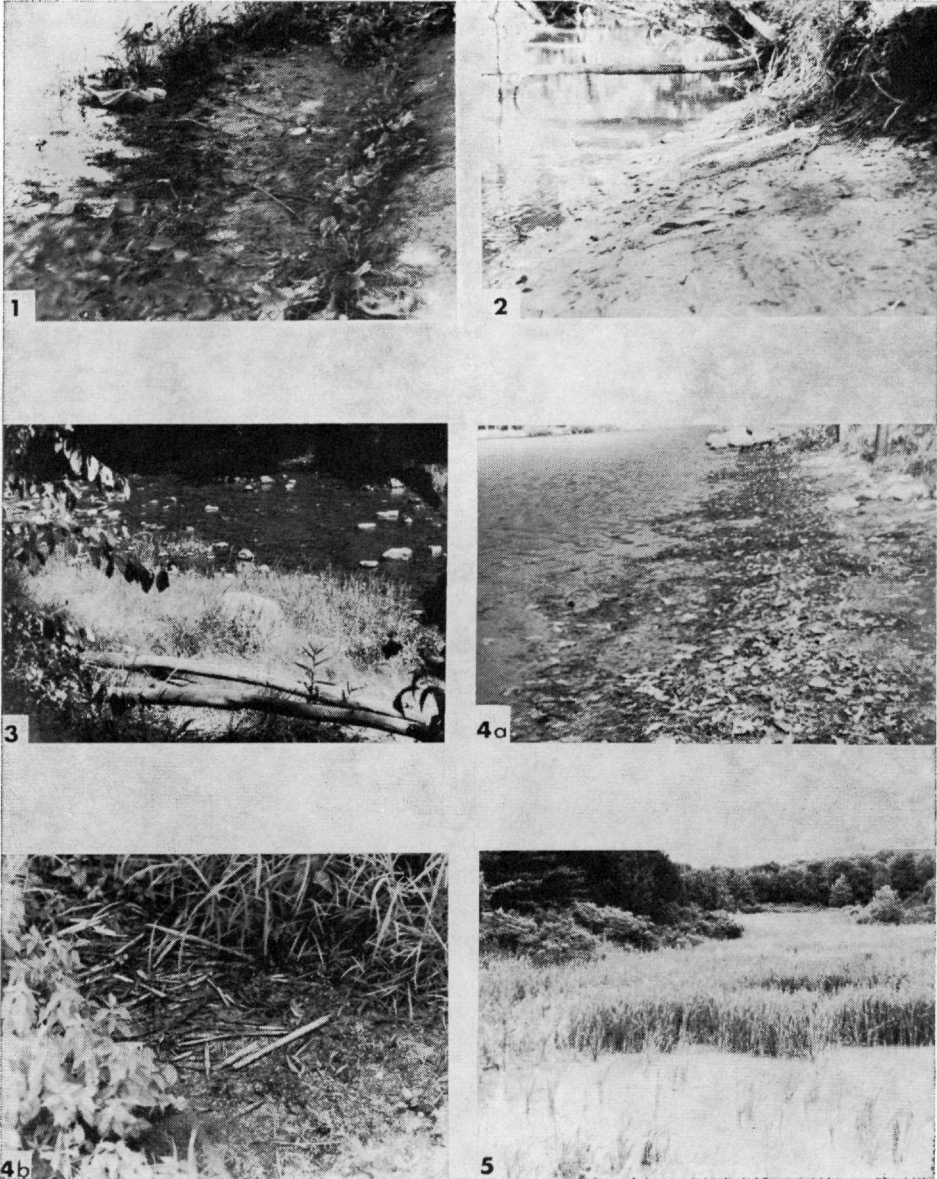
FIGS. 1-5. Ephydrid habitats of northeastern Ohio. 1, mud-shore; 2, sand-shore; 3, grass-shore; 4a, limnic-wrack composed mostly of filamentous algae and pondweeds ( Potamogeton spp.); 4b, limnic-wrack composed mostly of decaying cattail ( Typha latifolia ); 5, marsh-reed.

late summer. Plants typical of the grass-shore include Leersia oryzoides (L.) Swartz (Cut Grass), Glyceria striata (Lam.) Hitchc. (Manna Grass), Carex lurida Wahl. (Sedge), Eleocharis smallii Britt. (Spike Rush), Polygonum hydropiper L. (Water Pepper), and Bidens cernua L. (Beggar's Ticks). Other species found at one time or another in the grass-shore habitat were: Echinochloa crusgalli (L.) Beauv. (Barnyard Grass), Ranunculus septentrionalis Poir. (Swamp Buttercup),