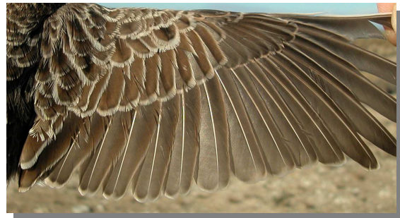
Dupont's Lark. Autumn: pattern of wing (24-IX).