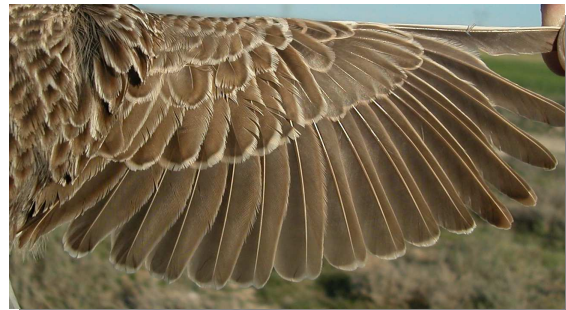
Dupont's Lark. Spring. Adult: pattern of wing (02-IV).