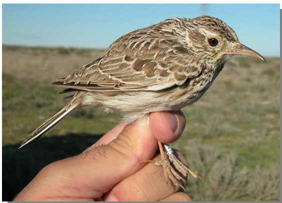
Dupont's Lark. Spring. Adult (02-IV).

Resident. Breeds in dry areas from the Ebro Basin and Sistema Iberico.