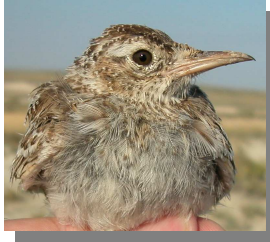
Dupont's Lark. Breast pattern: top left in autumn (24-IX); top right adult in spring (02-IV); left juvenile (04-VII).