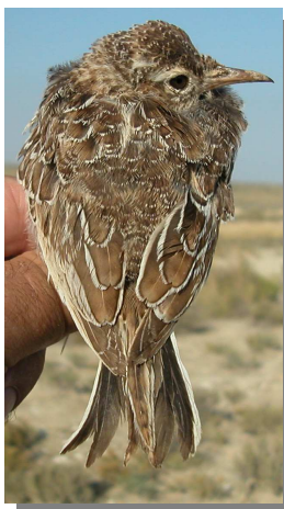
Dupont's Lark. Upperparts pattern: top left in autumn (24-IX); top right adult in spring (02-IV); left juvenile (04-VII).