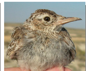
Dupont's Lark. Ageing. Pattern of breast: left adult; right juvenile.