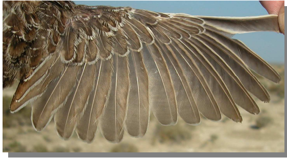
Dupont's Lark. Spring. Juvenile: pattern of wing (04-VII).