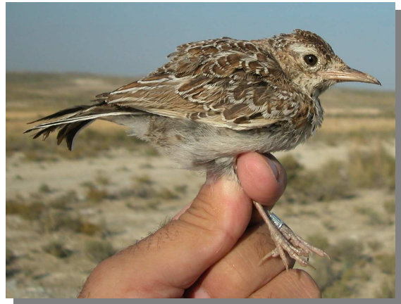
Dupont's Lark. Spring. Juvenile (04-VII).

Dupont's Lark. Ageing. Pattern of upperparts: left adult; right juvenile.