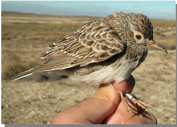
Dupont's Lark. Autumn (24-IX).