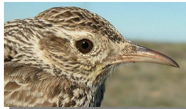
Dupont's Lark. Ageing. Pattern of head: top adult; bottom juvenile.

After the postbreeding/postjuvenile moult, ageing is not possible using plumage characters.