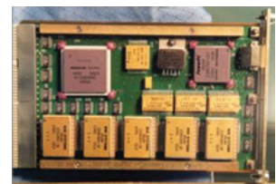
Figure 2: Three generations of BAE Systems space processors