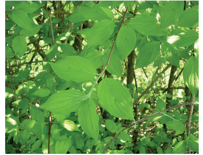
Oval leaves with entire margins and evident veins.

the fungus Colletotrichum acutatum observed in Iran 27 , or rots on young seedlings caused by the oomycete Phytophthora citricola in Bulgaria 28 . The widespread use of cultivars vegetatively propagated and the deforestation of natural populations are increasing the attention on threats of genetic erosion. Mainly in the countries where the cornelian cherry covers an important economic role, new genetic protection programmes have been created for germplasm conservation 3, 17, 20, 29 .