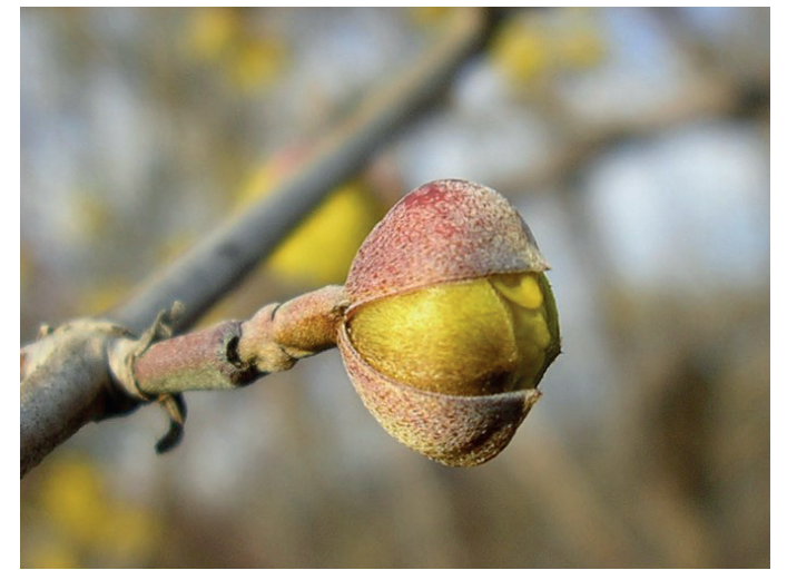
Floral bud blossoming in early spring.