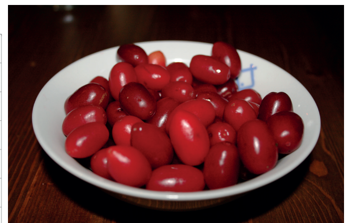
The fleshy fruits of Cornelian cherry are edible and used for a variety of culinary purposes.