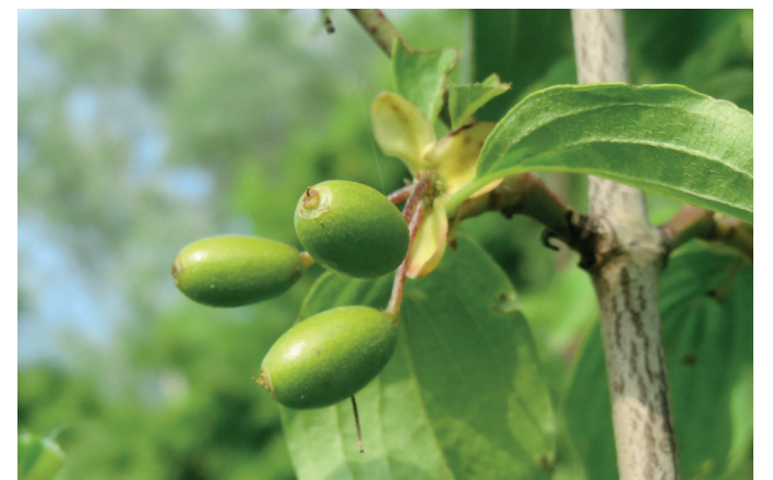
Olive-shaped green drupes maturing in spring.

Field data in Europe (including absences) ● Observed presences in Europe ●