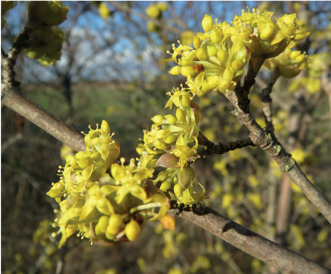
Cluster of hermaphrodite flowers composed of 4 yellow stamens and petals and 4 greenish sepals.

For this purpose several cultivars have been selected, bearing fruits with different sizes, taste (acidity and sweet) and colours (from creamy white, yellow, orange, red, violet to black); e.g. the 'Macrocarpa' variety bears large and pear-shaped fruits, 'Alba' white fruits and 'Flava' yellow and sweeter fruits 4 . In Asia, Cornelian cherries are also made into an alcoholic beverage, similar to the 'Drenja' beverage produced in Serbia 22 . Fruits are rich in tannins and sugars as well as phenols, ascorbic acid, flavonoids and anthocyanins 23, 24 . Traditionally the fruits were used as a diuretic, analgesic and tonic. In Middle Age cornelian cherry shrubs were commonly planted in monastery gardens 4 . Recently its therapeutic properties have been well documented, finding high antioxidant and anti-inflammatory properties with beneficial effects on cardiovascular, endocrine, gastrointestinal and immune systems 22, 24, 25 . The abundance of flowers