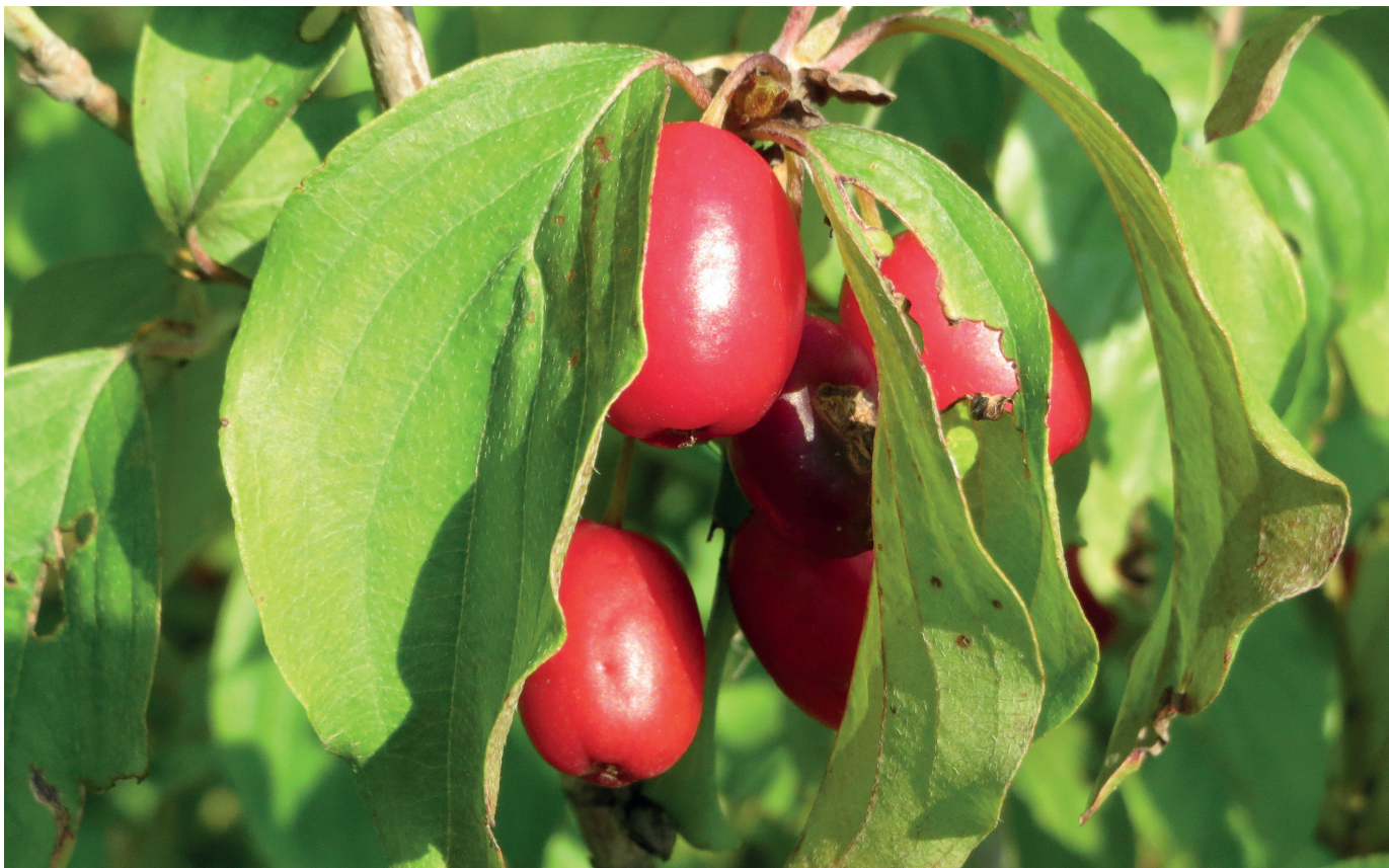
Bright red cherry-like fruits are produced in summer.