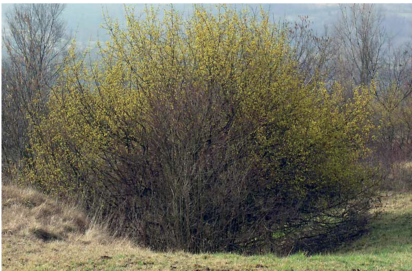
Shrub form of Cornelian cherry with yellow flowers blossoming before foliage develops in spring.