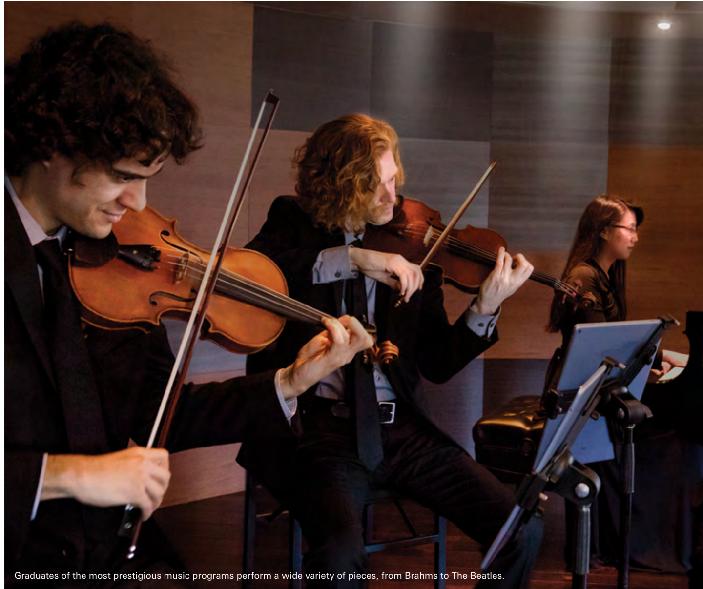
Graduates of the most prestigious music programs perform a wide variety of pieces, from Brahms to The Beatles.