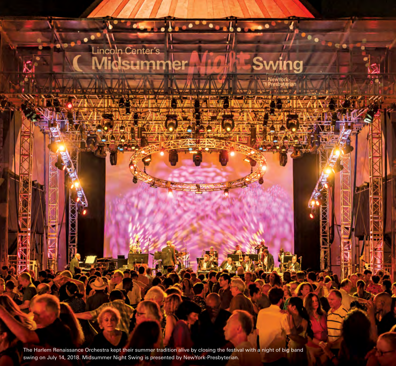
The Harlem Renaissance Orchestra kept their summer tradition alive by closing the festival with a night of big band swing on July 14, 2018. Midsummer Night Swing is presented by NewYork-Presbyterian.