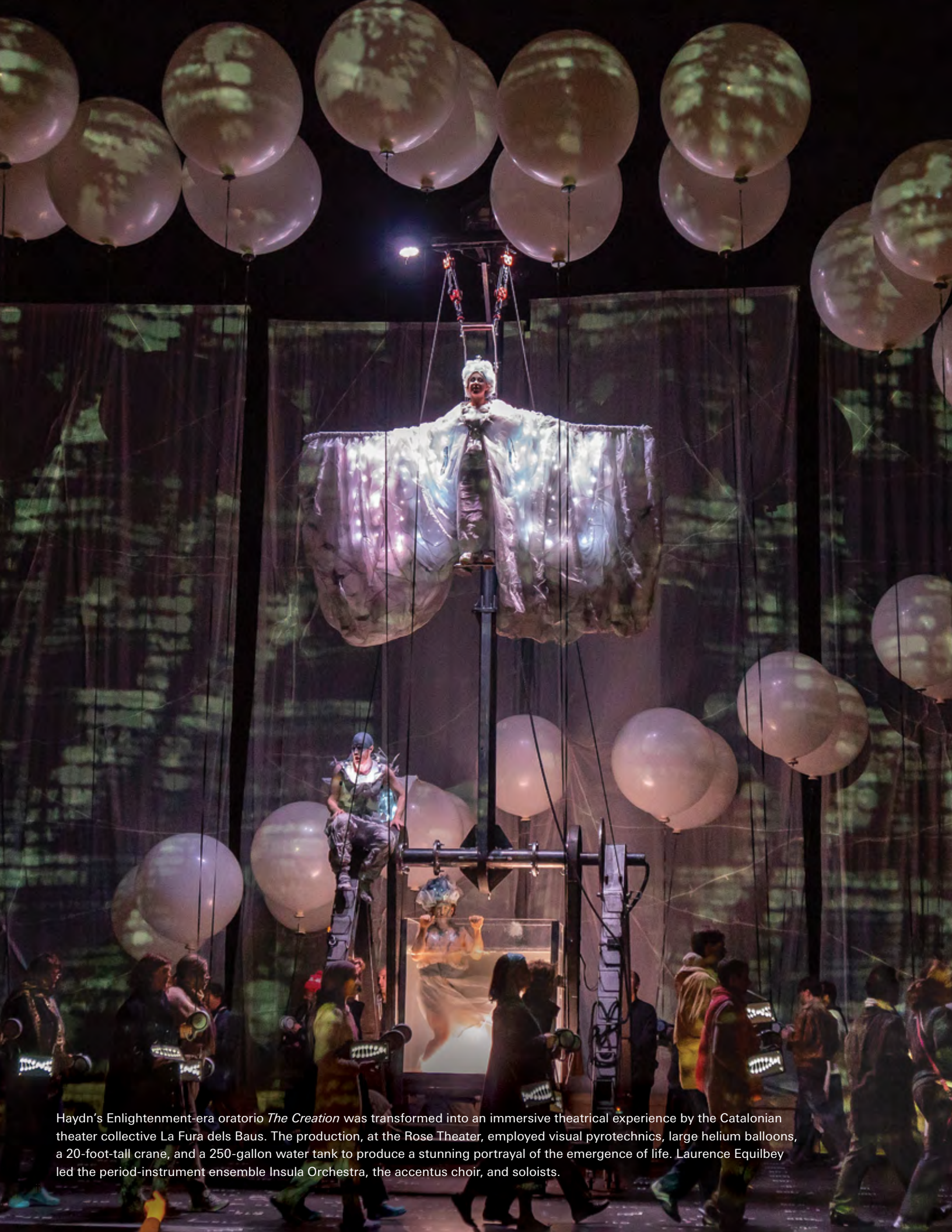
Haydn's Enlightenment-era oratorio The Creation was transformed into an immersive theatrical experience by the Catalanian theater collective La Fura dels Baus. The production, at the Rose Theater, employed visual pyrotechnics, large helium balloons, a 20-foot-tall crane, and a 250-gallon water tank to produce a stunning portrayal of the emergence of life. Laurence Equilbey led the period-instrument ensemble Insula Orchestra, the accentus choir, and soloists.