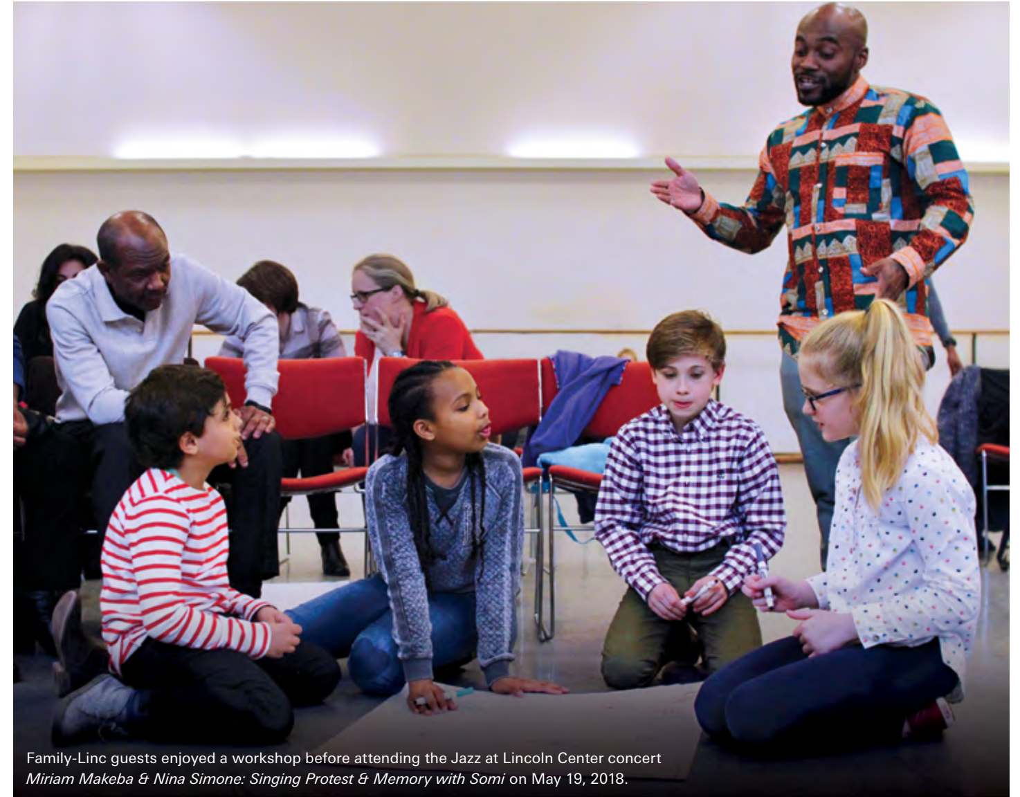
Family-Linc guests enjoyed a workshop before attending the Jazz at Lincoln Center concert Miriam Makeba & Nina Simone: Singing Protest & Memory with Somi on May 19, 2018.