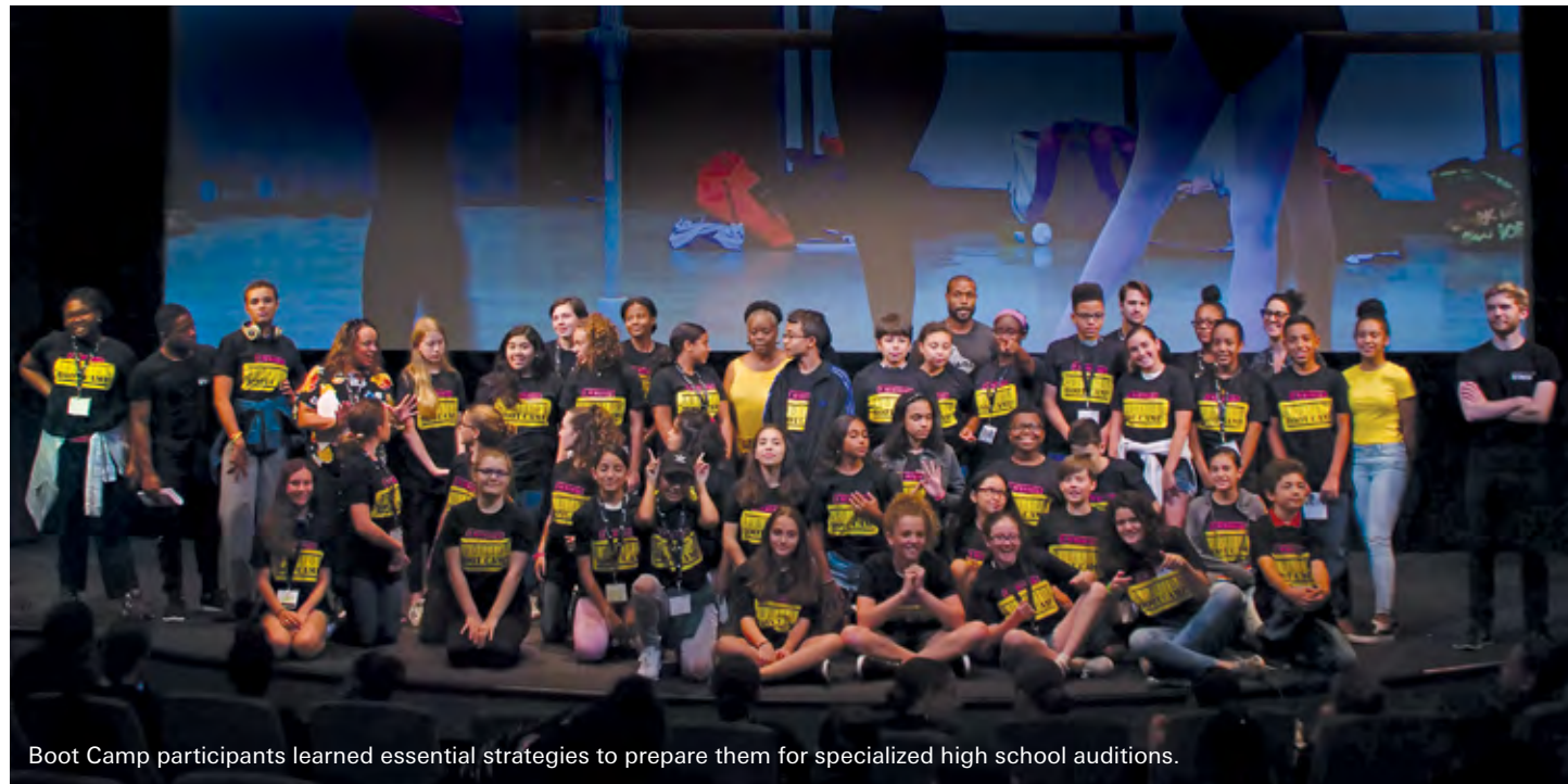
Boot Camp participants learned essential strategies to prepare them for specialized high school auditions.