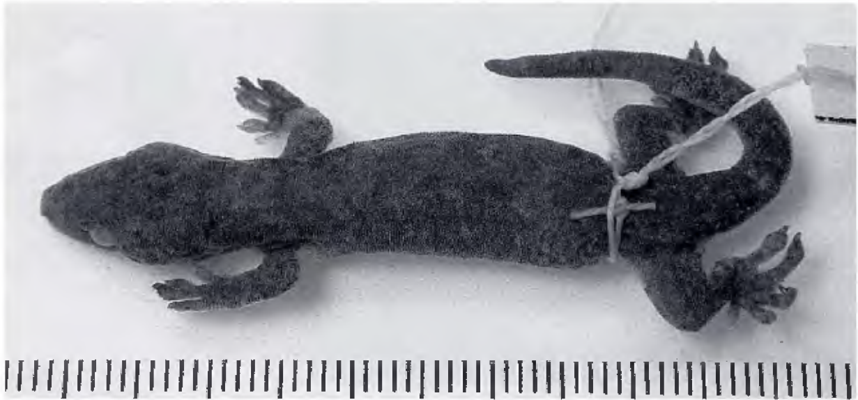
Fig. 1. The holotype of Lepidodactylus tepukapili , USNM 531712.