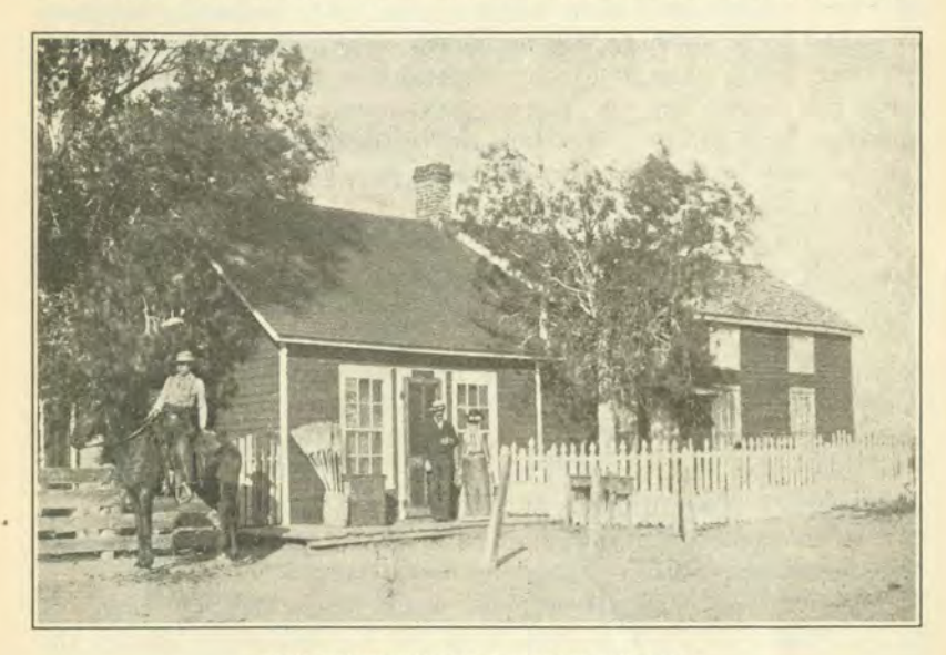
THE TWENTY-MILE HOUSE IN 1891.

After they had broken camp and departed the settlers would visit the spot, looking for arrowheads and other possible souvenirs. On one occasion they found an aged squaw who had been left behind to die, as that was often their custom. The outraged citizens, including my father and Horatio Foster, loaded the poor