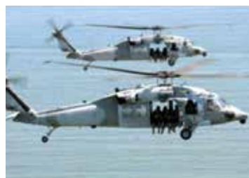
MARITIME PATROL AND SAR