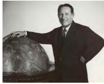
Promotional photo of Abe Saperstein.

Who would have thought that someone who was 5'5" tall and born in England would be inducted into the Basketball Hall of Fame? That's the story of Abe Saperstein (1902-66), a longtime Manor resident who is best known as the founder of the famed Harlem Globetrotters exhibition basketball team.