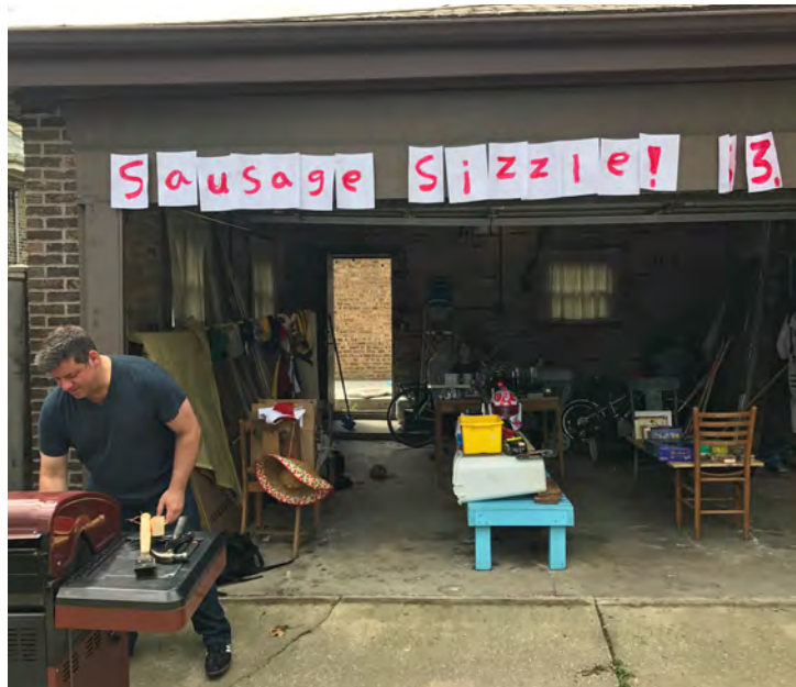
This year's sale was held on Sunday, May 21st.