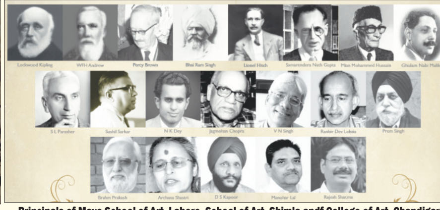
Principals of Mayo School of Art, Lahore, School of Art, Shimla andf College of Art, Chandigarh