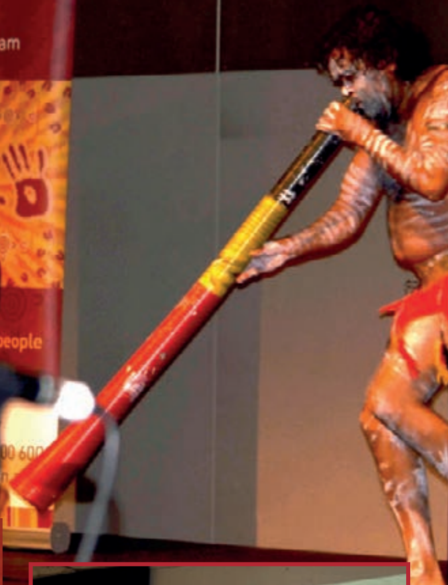
▼ Stephen 'Gadlabardi' Goldsmith and Jamie 'Nungana' Goldsmith from Taikurtinna dance group performing the Welcome to Country at the 2013 World Elder Abuse Awareness Day Conference