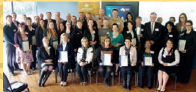
▲ Winners of the different categories

The Aboriginal Burns Program is a successful model that effectively engages with stakeholders from various professions to jointly achieve fewer burn injuries through customised and specifically targeted community education.