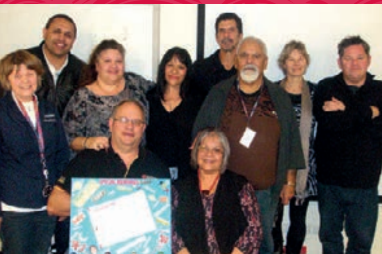
▲ Group launch