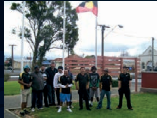
▲ Proud Grandfather