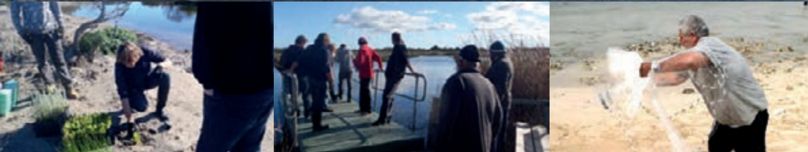
▲ Re-vegetating regional areas in the South East