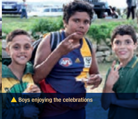
▲ Boys enjoying the celebrations