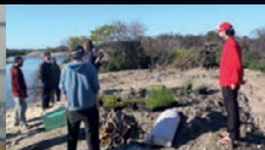
▲ A lighter moment