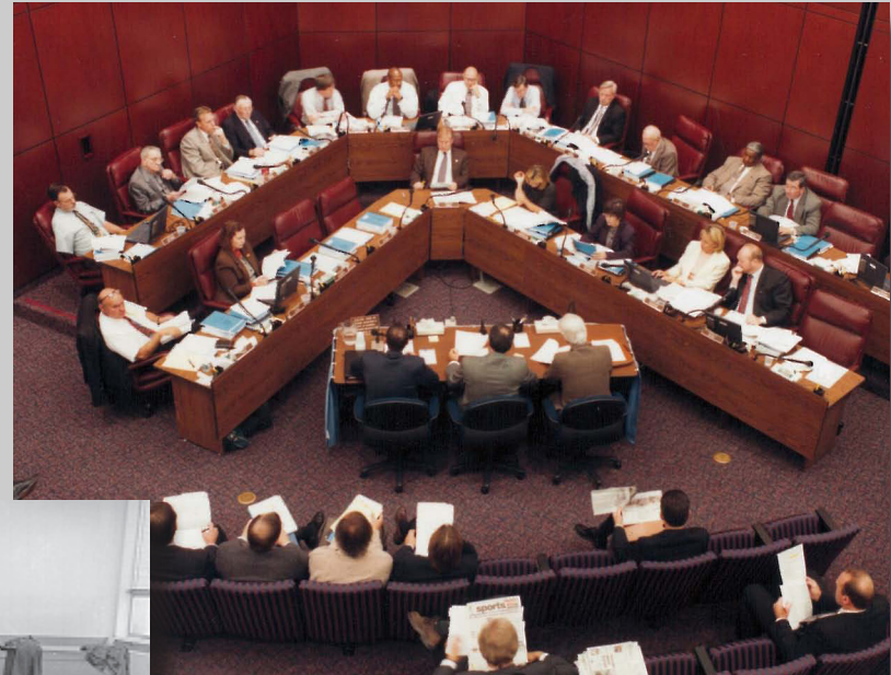
Joint Assembly and Senate Committee Meeting, 2001

Compiled by the Research Library Research Division Legislative Counsel Bureau