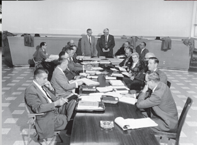
Senate Committee Room, 1959