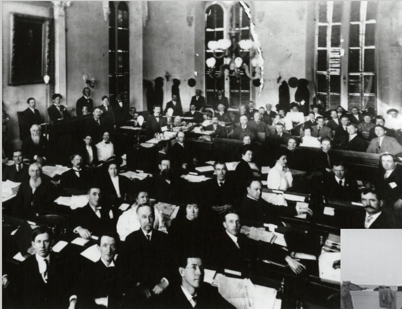
Nevada Legislature, c.1895