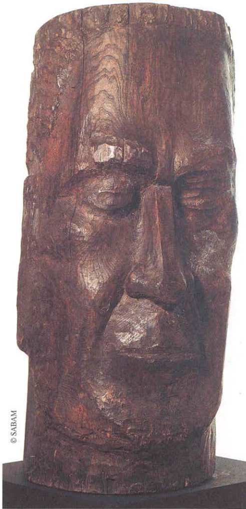
Self-portrait (1940) C. Permeke Museum

Constant Permeke was born in Antwerp on 31 July 1886. His father, who was also an artist, was his first teacher; Ensor was a friend of the family. After studying at the Bruges and Ghent academies, Permeke spent time at the village of Laethem-Saint-Martin, where a group of Flemish artists – Minne, De Saedeleer, Van de Woestijne and Servaes – had developed their own particular anti-naturalist and symbolist style. This was where Permeke and his companions Gust De Smet and Frits Van den Berghe went on to develop their own vision in the form of Flemish Expressionism . Their interest in the psychic dimension of social life led them to a free interpretation of reality.