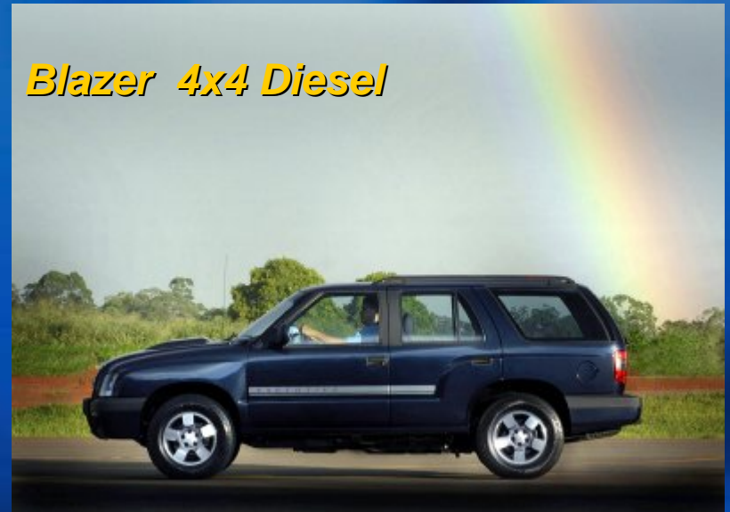
Blazer 4x4 Diesel