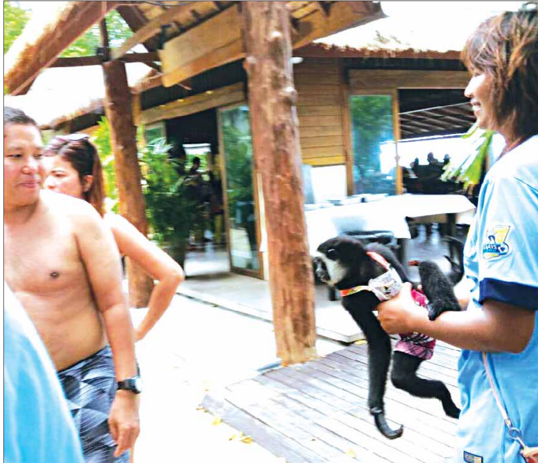
Phi Phi Police and national park officers vow to hunt for a pair of gibbons and their touts, following a Phi Phi tourist snapping shots of them pushing the primates onto tourists in the popular island destination of Ton Sai. For the full story, visit PhuketGazette.net .

emony of putting ‘ Din Praratchataan ’, funeral soil given by the Bureau of the Royal Household, on the grave.