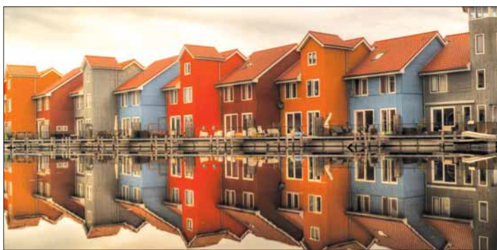
Rising fees make this year a better time to buy.