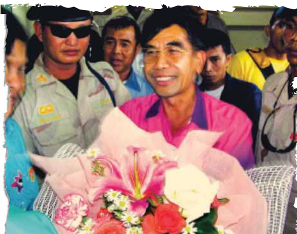
No thanks: Gov Udomsak grins as he declines to accept a bouquet from some limousine drivers.