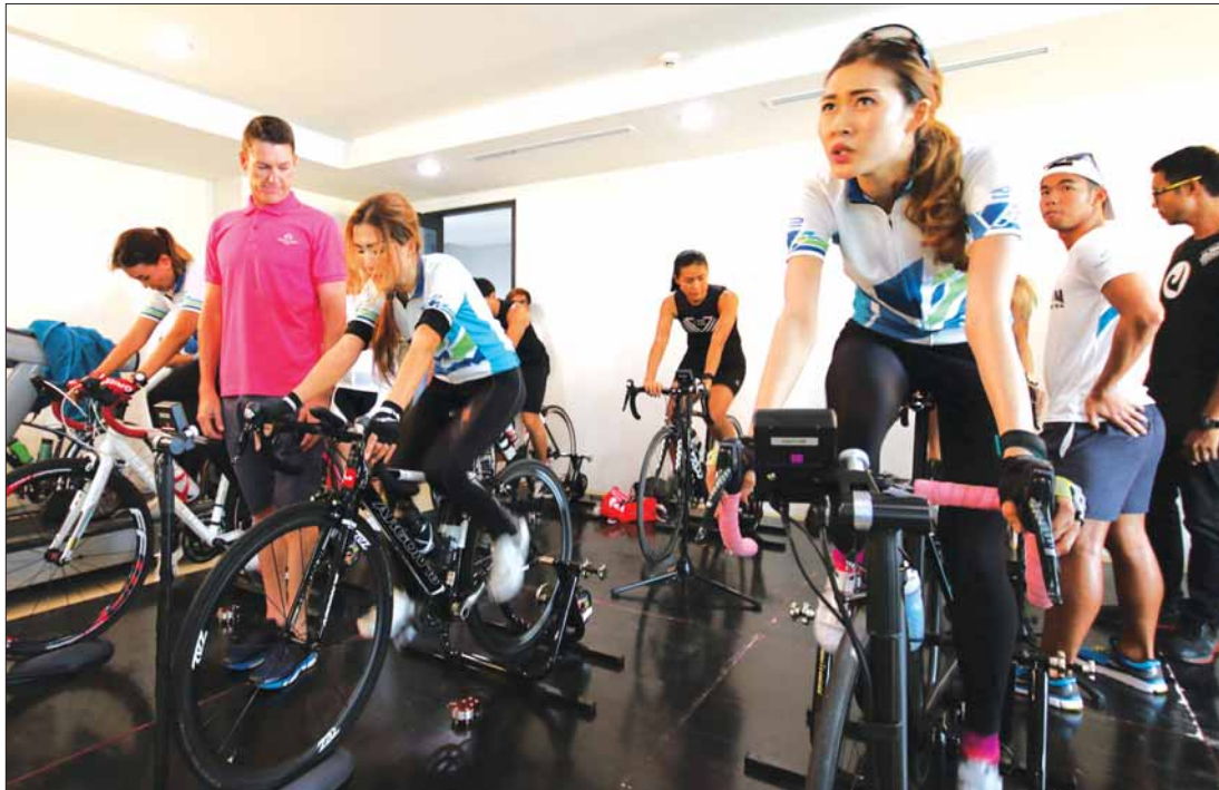
Many people who start cycling recreationally start thinking about joining competitions as they get fitter.