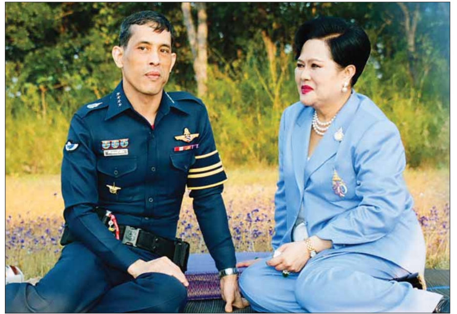
His Royal Highness Crown Prince Maha Vajiralongkorn wishes to express his gratitude and loyalty to Her Majesty the Queen.