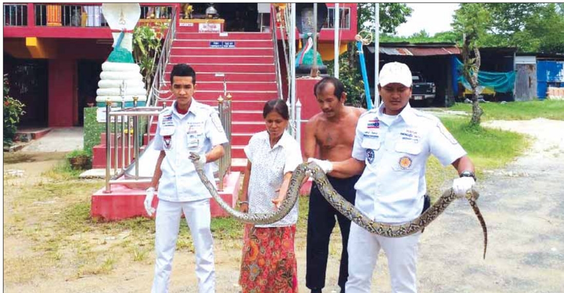
Rescue workers catch the python at Baan Toh Sae shrine in Kathu.