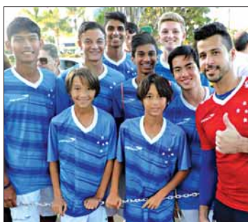
BISP boys travel to Brazil to learn from Cruzeiro EC.

"It has been a great opportunity for them to meet with and learn from our professional players, the president, and ev-