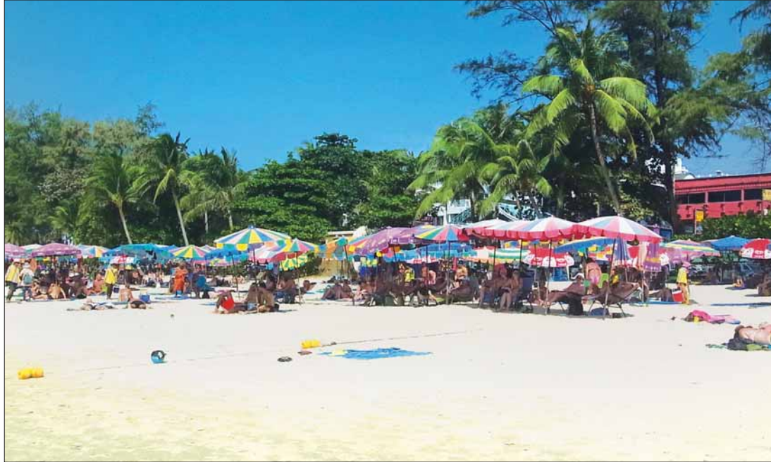
A final decision on the fate of Phuket's beach chairs is coming soon.

"I would like to make it clear. We will continue to strictly enforce the rules pro-