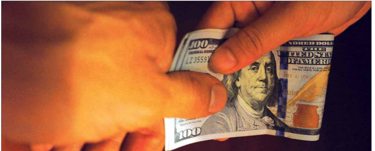
Money games galore on this paradise island, says Phuket Anti-Corruption Network President.

The top ten 'most corrupt' offices out of the 25 options