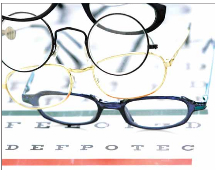
More than 30 million baht has been approved for public hospital eye-care centers.

"Currently, we have an ophthalmologist from Vachira