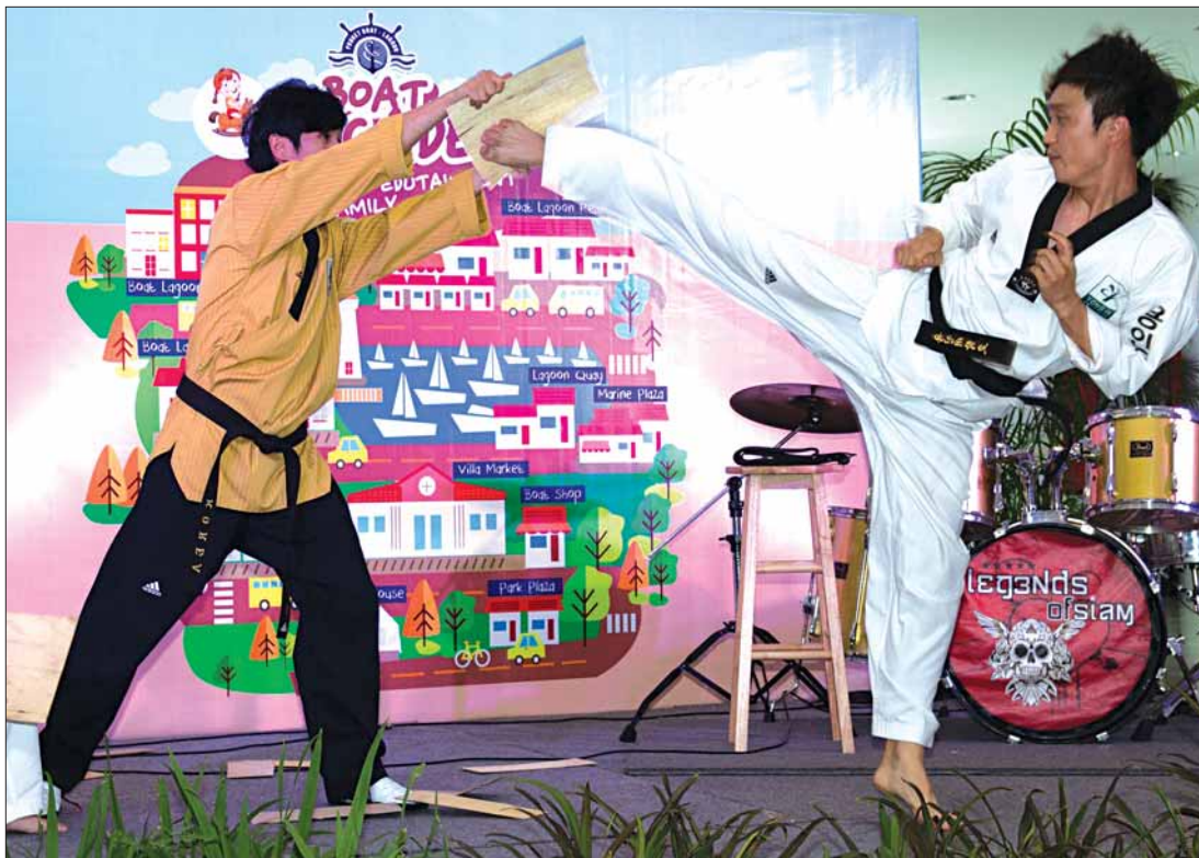
Taekwondo is one of the many skills that children and adults can learn at the new facility.

"As you can see, we are really transforming Boat Lagoon from a working marina to a lifestyle marina and village. We called it the 'New Boat La-