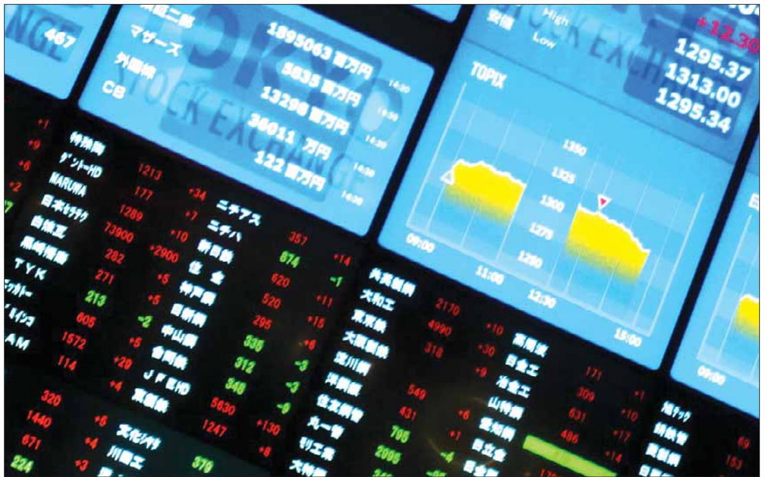
Risk-averse investors may be hesitant to invest in bank stocks with a global footprint.

Given the steady drumbeat of negative news or uncertainty surrounding China, the Euro/EU, Greece and now Puerto Rico which appears to be heading in the same direction as Greece, risk-averse inves-