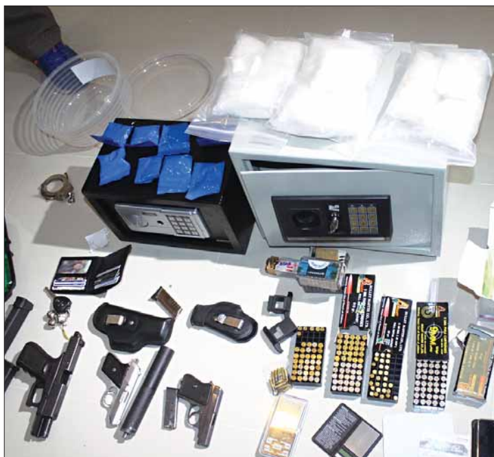
Police seized more than five million baht worth of drugs.

Police also discovered four handguns, one silencer, 400 rounds of ammunition, 2.15 kilograms of ya ice (crystal methamphetamine) and 1,469