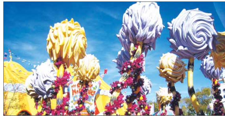
To understand natural beauty, just read Dr Suess.

I know it is easy to complain about the projects, but we need to be considerate of the people who are working their hardest to make Phuket better for everyone. At the same time, we encourage everyone to keep an eye on the projects and let us know how we can improve them and keep them safe. We will work together to drive our island forward.