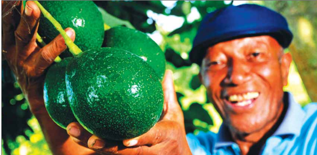
The Thai avocado season is in full swing. Don't miss out on its wonderful benefits.

The result of the National Health and Nutrition Examination Survey (NHANES) 2001–2008 says that: "Avocado consumption is associated with better diet quality and nutrient