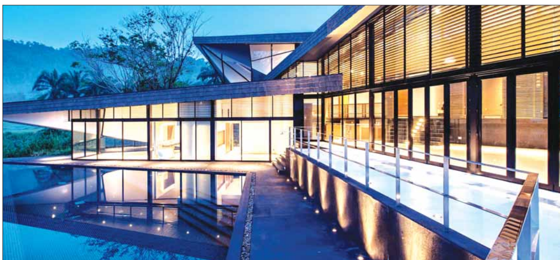
The unique and unusual design includes large angular roof shapes that form dramatic interior spaces.

Around 150 tonnes of steel fabricated into four trusses form the structure, touching earth at four points only. Two dominant triangulated forms are a 1:1 ratio of earth and lake and form