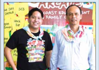
Boat Arcade: Entertain the children and the parents will come.