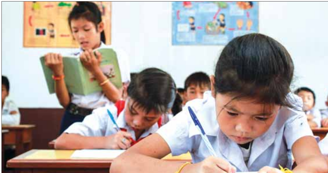
Demand growth is sustained by the growing number of Thais who perceive international schools as the passport to pursuing higher education overseas.

High demand has been filling up emerging new supply briskly. In just six years since opening, HeadStart achieved a student population of 512. The enrollment in Kajonkiet International School Phuket (KIS) surged tenfold from 23 in 2011