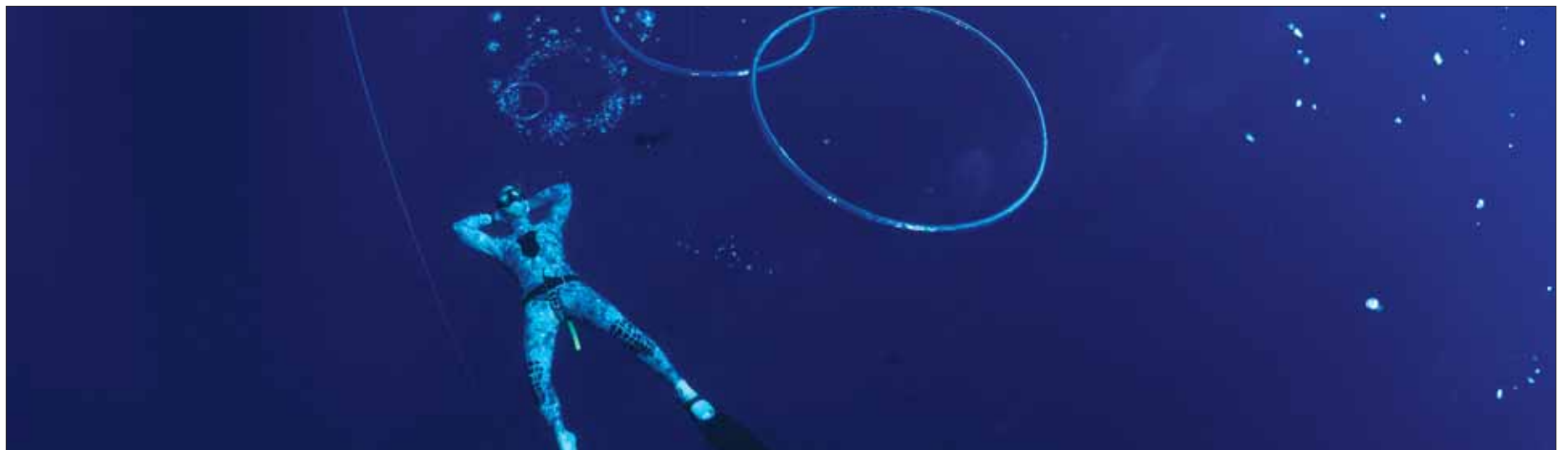
The new PADI freediving curriculum offers three student courses and three instructor levels.