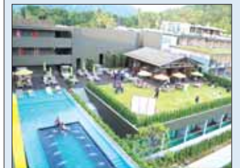
Nook Dee Resort owner says Kata Beach is best place to attract FIT.