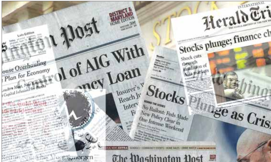
The 2008 financial crisis was caused by a massive housing bubble in the US.

A market correction is usually defined as a 10 per cent decline to adjust for an over-valuation in a market that is otherwise in a longer term uptrend or bull market, and such declines can be localized to certain sectors or asset classes. A market correction is often just a way for the market to bring some sense to