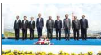
Officials at the Hongsa Power Plant ceremony.

Under the current agreement, Thailand has agreed to