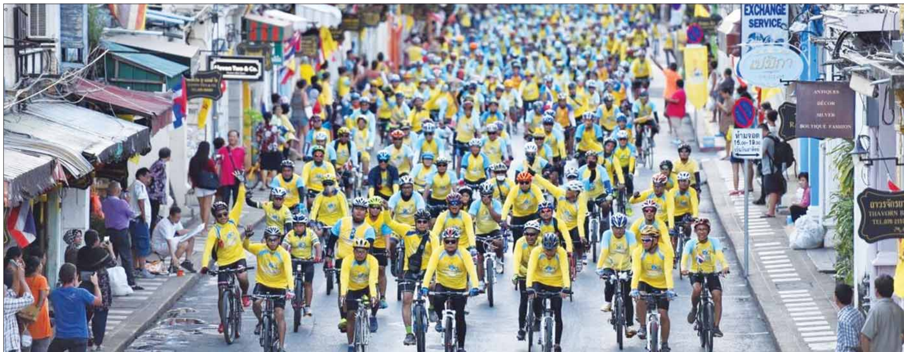
More than 5,000 participants joined in the Phuket leg of the nationwide event that was held to honor HM King Bhumibol Adulyadej for his 88 th birthday.