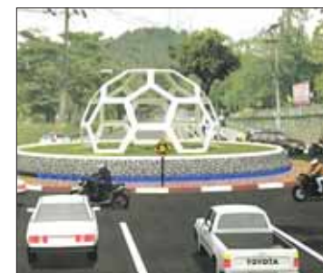
The roundabout is designed to increase safety.

The roundabout will provide motorists with enhanced visibility, while its aluminium-composite frame will be durable and will require low maintenance.