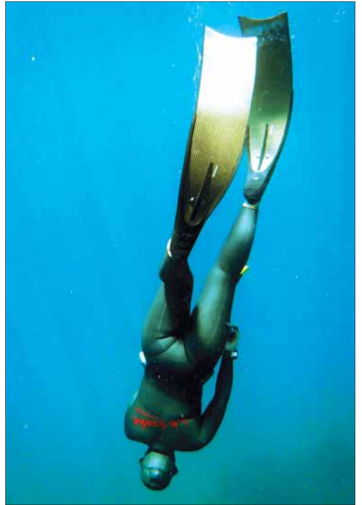
Sarah Witcher of ‘We Freedive’ makes a descent.

The freediving program now offers three student courses: Freediver, Advanced Freediver and Master Freediver. Additionally, there are three levels