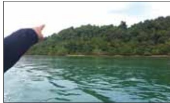
DSI investigates Naka Noi Island.