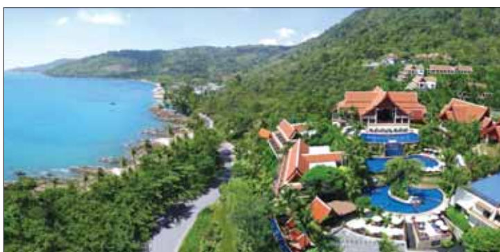
Novotel Phuket falls under AccorHotels' umbrella.

In the Asia-Pacific region, the group operates about 668