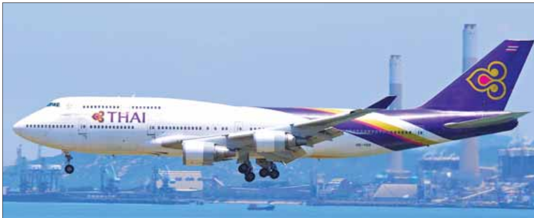
THAI airways was not on the updates Air Safety List drawn up by the EASA.

Some industry analysts had mistakenly feared that EASA might follow in the footsteps of the US Federal Aviation Administration (FAA), which earlier this month downgraded Thailand to a Category 2 rat-