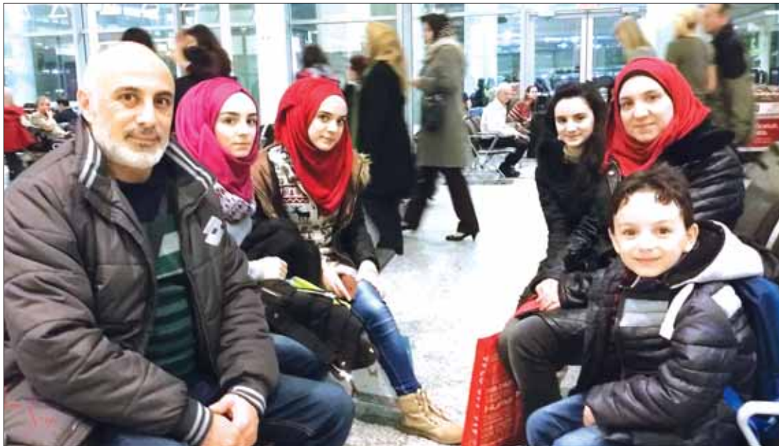
Thailand is not a signatory of the 1951 Refugee Convention.