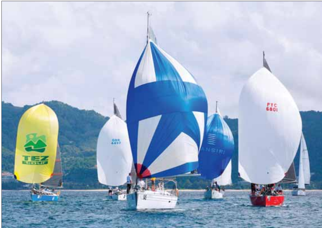
There was some serious class warfare on Kata Bay for the final day of the King's Cup.

"Courses were well organized but the light breezes are always challenging here. The team did well and the only reason I bought this boat was that I knew we had