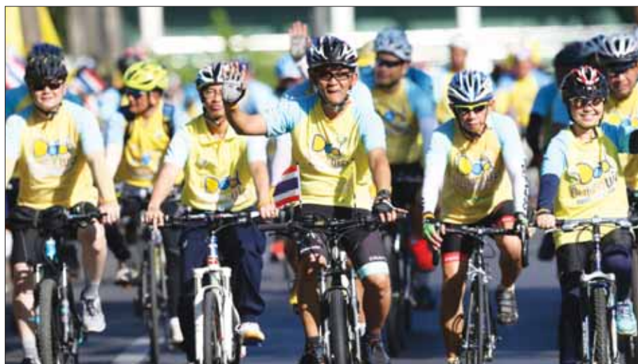
Phuket Governor Chamroen Tipayapongtada (center) led the group of cyclists during the procession throughout the island.