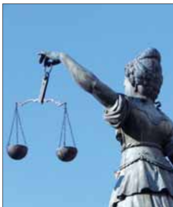
Thung Kham Ltd seeks to file a defamation lawsuit against a 15-year-old.

"Her interview is libelous to our firm," Thung Kham Ltd said in its letter to the center.