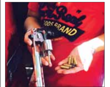
The gun and matching rubber bullets.

PHUKET police are hunting a jet-ski operator who pulled out a firearm on December 10 at Patong Beach.