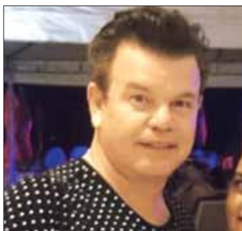
Paul Oakenfold at Xana.

"Every time I come here, I meet a lot of great people. I've got friends in Phuket... I can see some regular faces [here] and it really makes a differ-