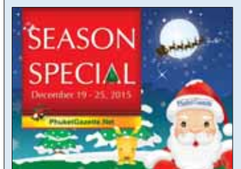
Don't be a grinch! Grab our Season Special to plan your perfect holiday.