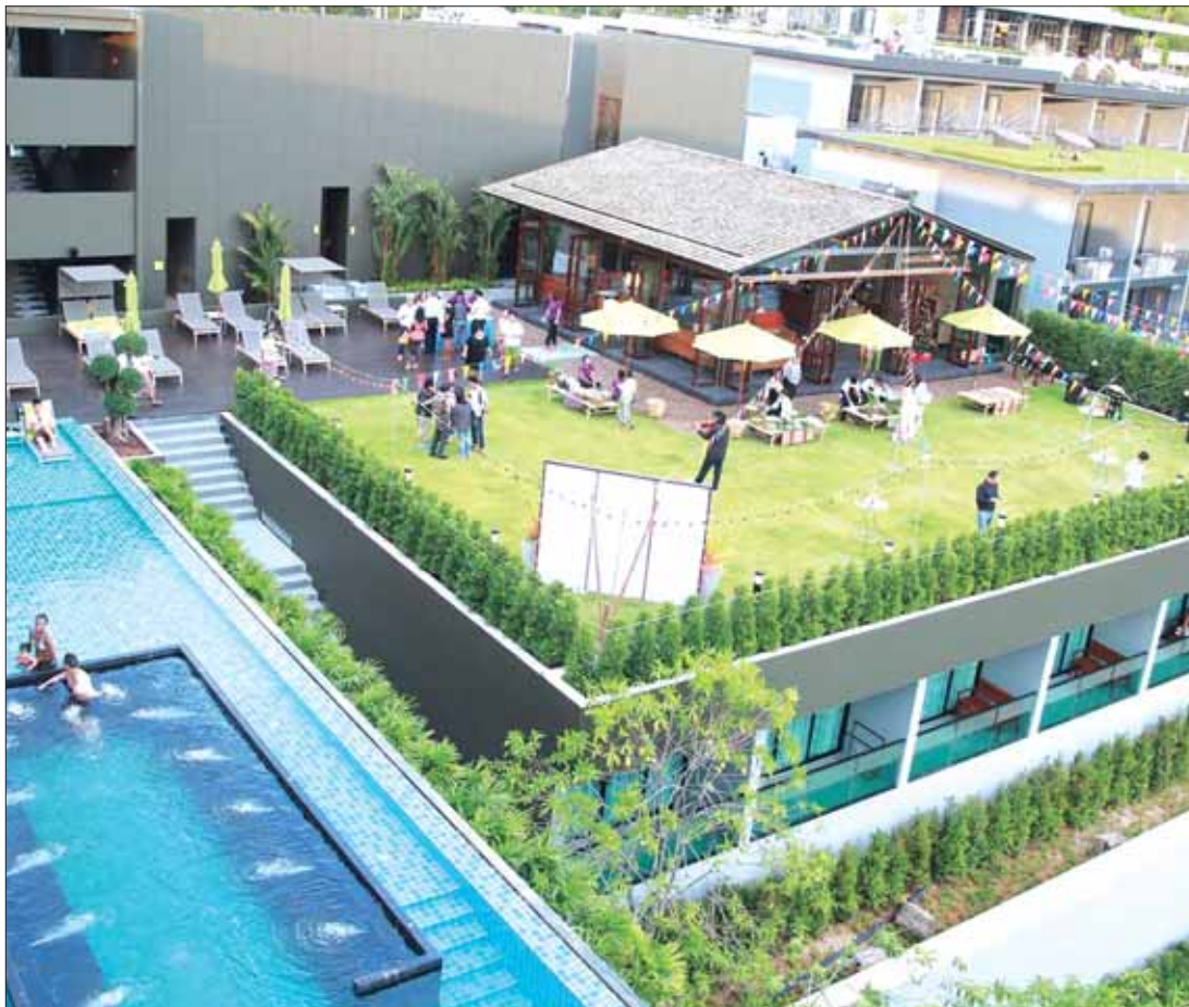
The resort was built on three rai of land at a total cost of about 500 million baht.

"We are selling a unique feeling of being in Thailand – bringing the exquisiteness of Thai culture and Thai cuisine to all of our guests. Not only