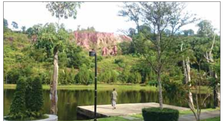
The picturesque early morning commute is the best part of my day.

We love Phuket. It is our beautiful home, and we want our home to have safe and clean food for its people.