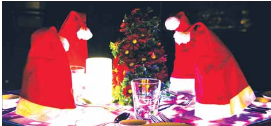
Stop by at Amari Phuket, Patong and enjoy Christmas feasts and festivities this season.

To spread the warmth of the festive season, join family and friends for traditional Christmas delicacies at Tre' in a 5-course set dinner.