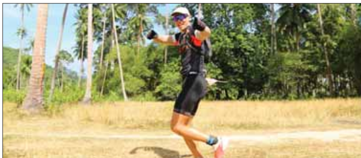
More than 500 athletes are expected to compete this year.

XTERRA Thailand and Active Management Asia (AMA) have partnered up to organize the 'Xterra Off Road Triathlon and Trail Run' on April 1 in Phuket. Following the success of Xterra Samui last year, the company is now hosting its debut event in the 'Asia Pacific Tour 2017 – Road to Hawaii'.