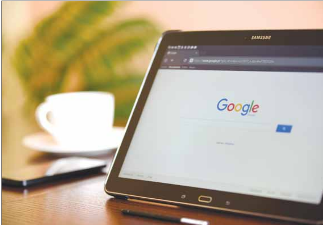
Using the right tools is important to get your business started on the right foot.

Your main priority would be branding, providing informative content, and most importantly,