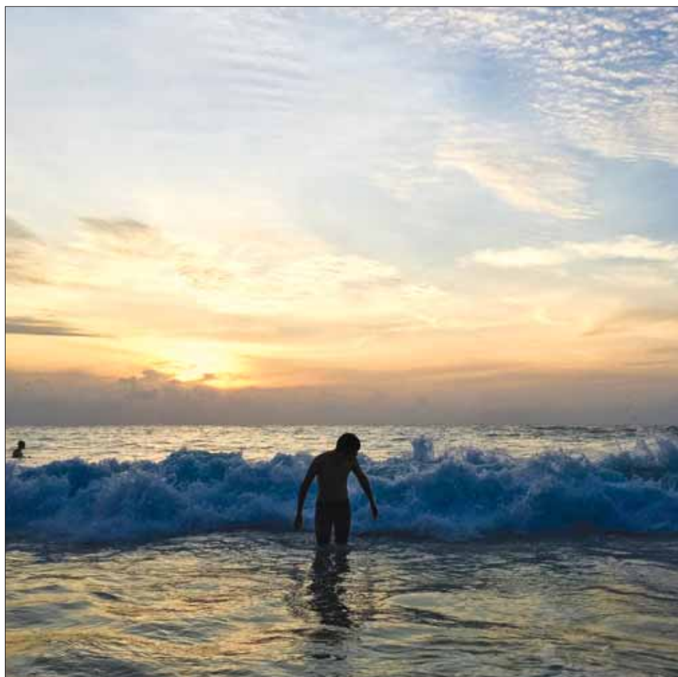
Since the end of 2015, Surin has been a ‘virgin’ beach, which means that no sun loungers, umbrellas or vendors are allowed on its sands.