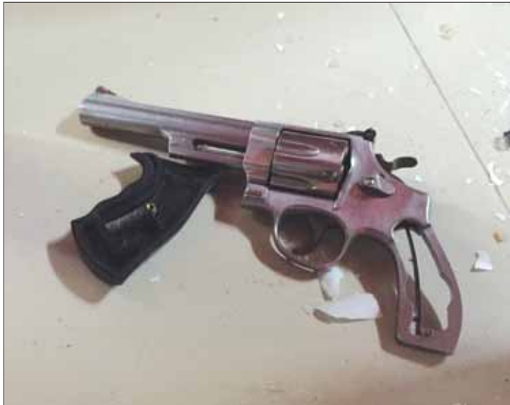
A number of similar incidents have taken place at Phuket's gun ranges over the years.