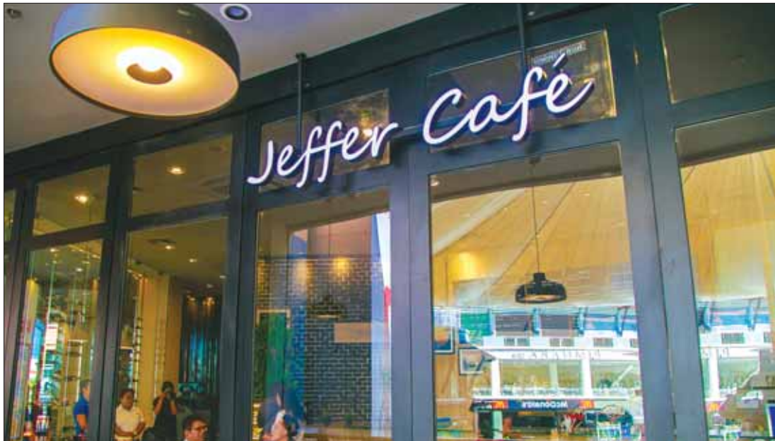
The flagship store at Jungceylon now features a cafe along with the steakhouse.

“The attractive feature of the flagship store is that we provide the full Jeffer menu here. For a more special Phuket and Andaman feel, we have added a seafood menu along with the