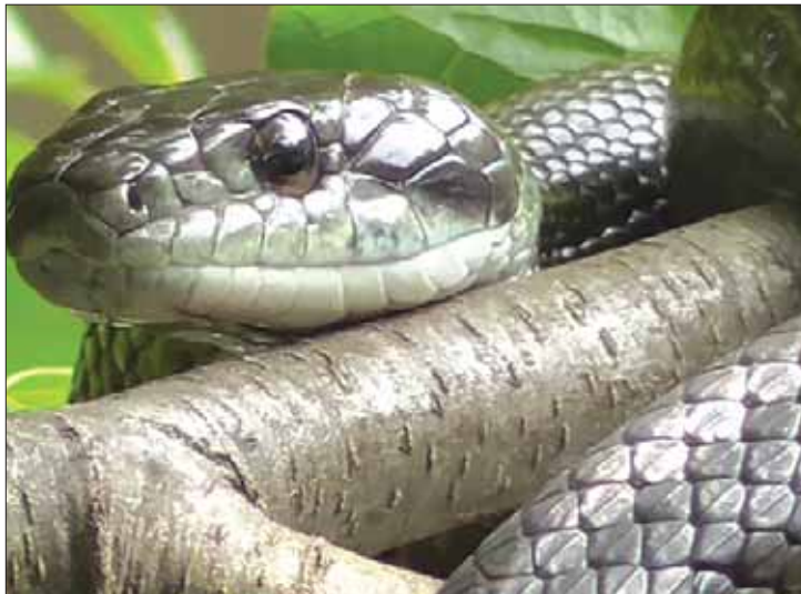
Many harmless varieties of snakes, including rat snakes, can be found in Phuket gardens.

Most varieties in your flower beds and shrubs will be harmless – rat snakes, kukris, wolf,