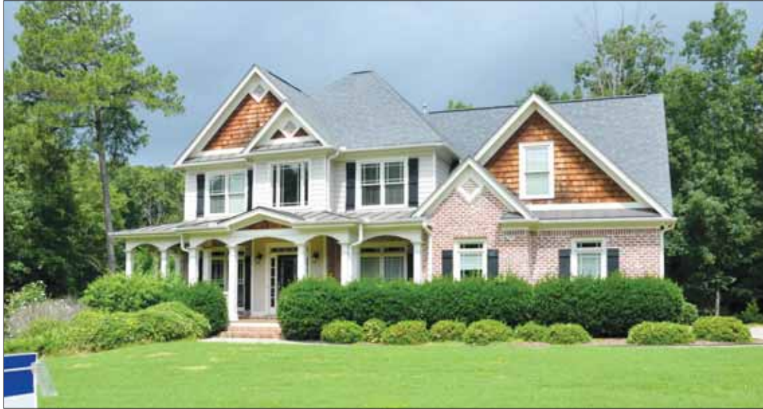
Brokers have a large selection of property and act as a liaison between buyer and seller.

Brokers will work closely with buyers to compile a focused and