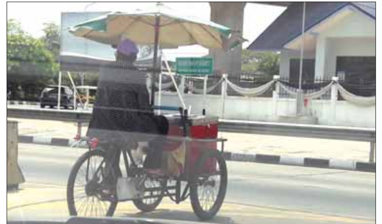
The risk of heatstroke is higher among people who have been out in the sun for a long time.

RISING temperatures have raised the risk of heatstroke, the Public Health Ministry warned on March 12.