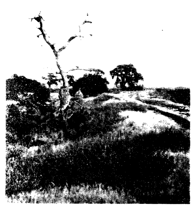
SOUTH BANK OF TOM PAINE SLOUGH, showing level work done by Chinese before the turn of the century. This is the site of the original bridge crossing.

This work of reclamation was done by Chinese laborers, many hundreds of them, using wheelbarrows to clean out the