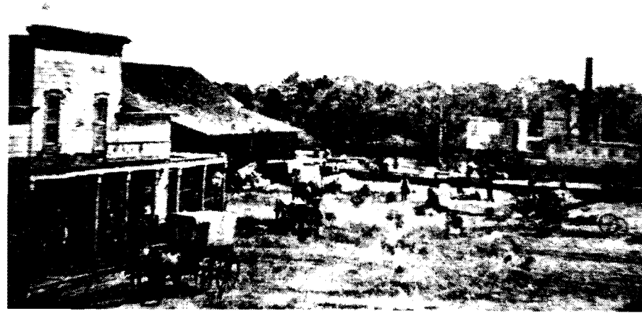
EARLY PHOTOGRAPH OF HILL'S FERRY. Note steamboat in background.

Taken from the Newman-Diamond Jubilee (1888-1963) publication.