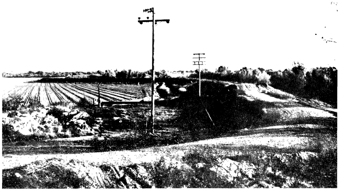
EAST SIDE OF THE SAN JOAQUIN RIVER, looking south from the approach to the Durham Ferry bridge. Trees lining the banks of Sturgeon Bend and the Stanislaus River may be seen along the horizon (top left half of photograph). San

The party then proceeded overland southeast for about six miles to a location on the north bank of the Stanislaus, about one and a half miles up from its mouth. The location had