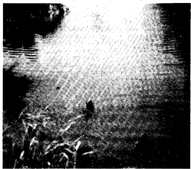
BRIDGE PILINGS ON SOUTH BANK of Tom Paine Slough. This is all that remains of the original bridge built by Chinese labor.

And then there was the road that branched off the River Road from his house and went diagonally across the land the Chinese had reclaimed in a northeasterly direction and across Tom Paine Slough on a bridge that they also built. The