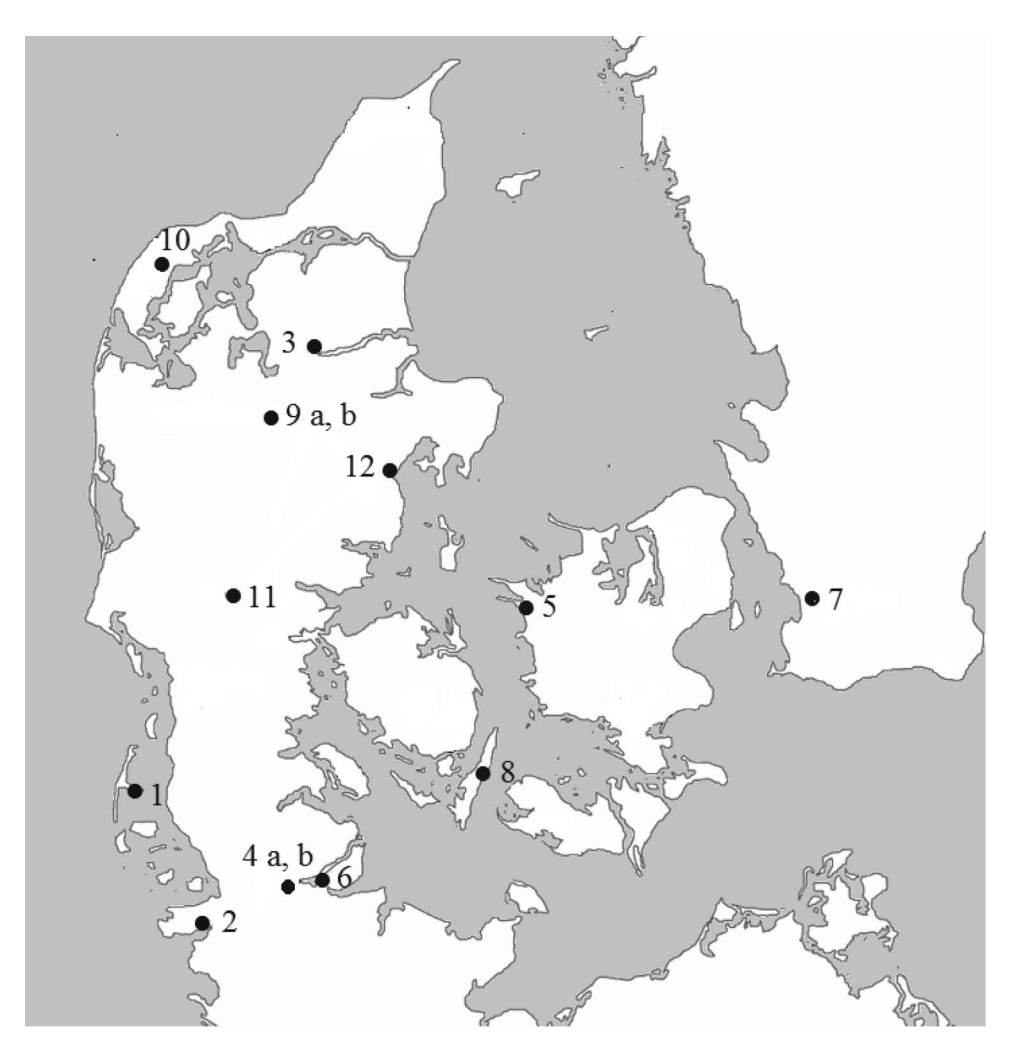
Figure 1. Map showing the locations with plant macro remains of garden plants discussed in this article. 1: Archsum, 2: Elisenhof, 3: Fyrkat, 4a: Hedeby settlement, 4b: Hedeby harbour, 5: Kalundborg, 6: Kosel, 7: Färgaren, Lund, 8: Stengade II, 9a: Viborg, St. Skt. Pederstræde, 9b: Viborg Søndersø, 10: Tinggård, 11: Vorbasse, 12: Århus Søndervold.

single find of angelica from Hedeby (Table 1) may have entered the archaeological context from natural habitats, but there is a real possibility that angelica was cultivated during the Viking Age.