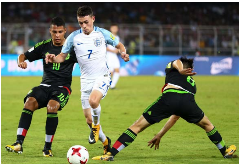
Philip Foden (ENG, 7)

This award goes to the best player in the final competition on the basis of a ranking compiled by the FIFA Technical Study Group. A Silver Ball and a Bronze Ball are awarded to the second and third best players.