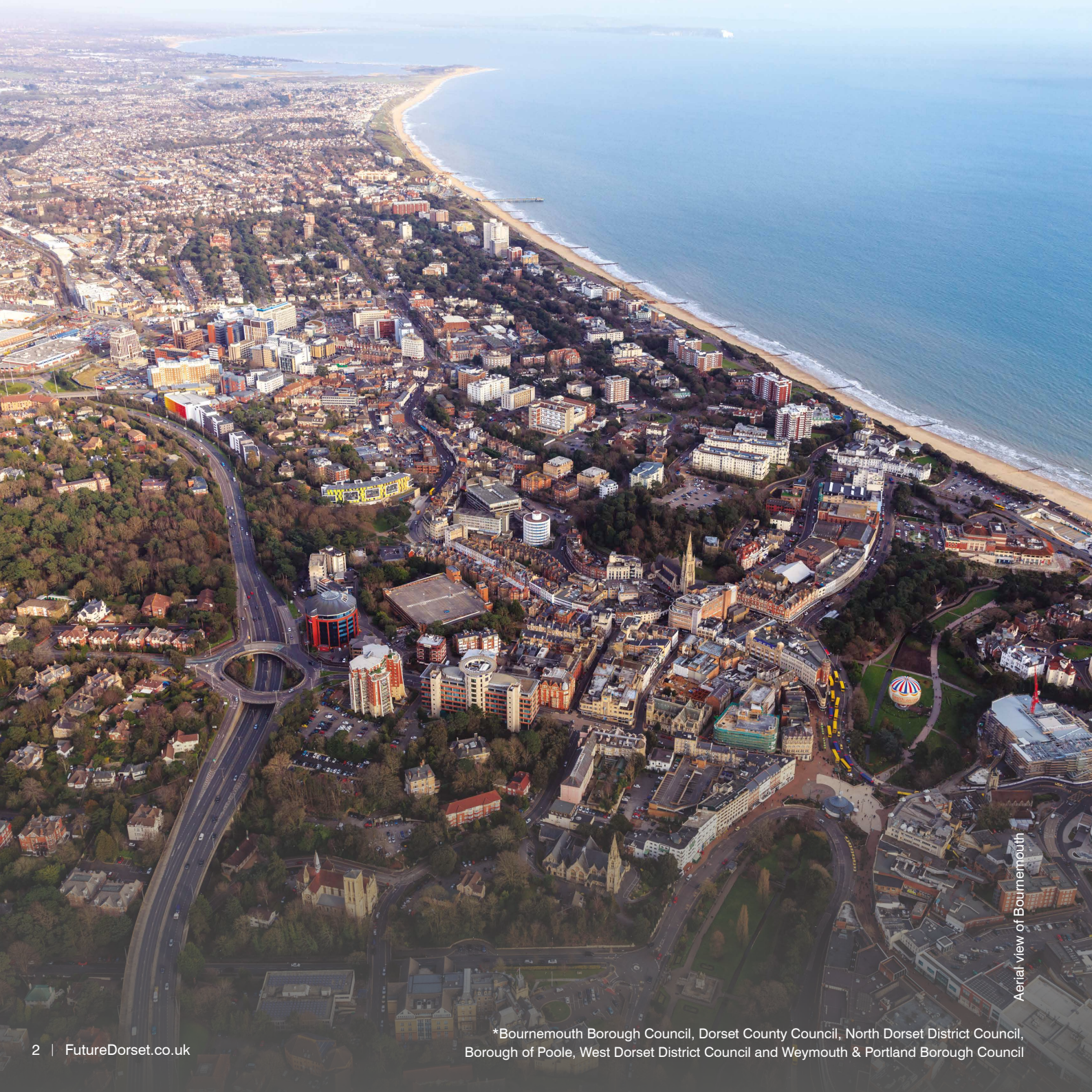
Aerial view of Bournemouth