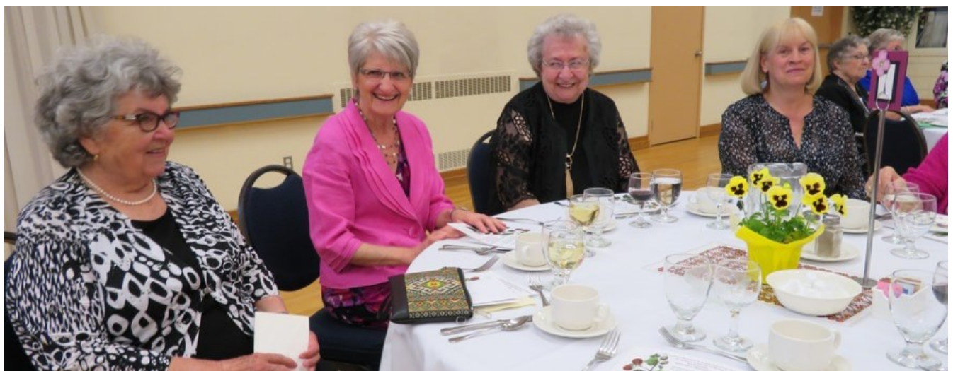
Members and guests in attendance at the U.W.A.C. Annual Members' Dinner.