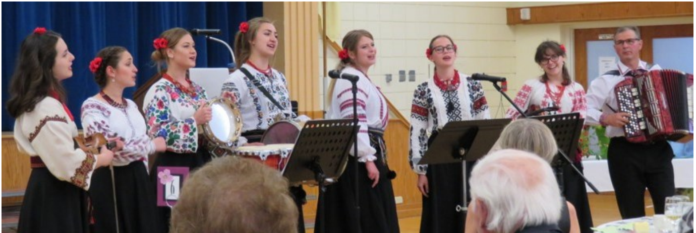
“RUTA” ensemble entertains the crowd at the Annual Dinner.