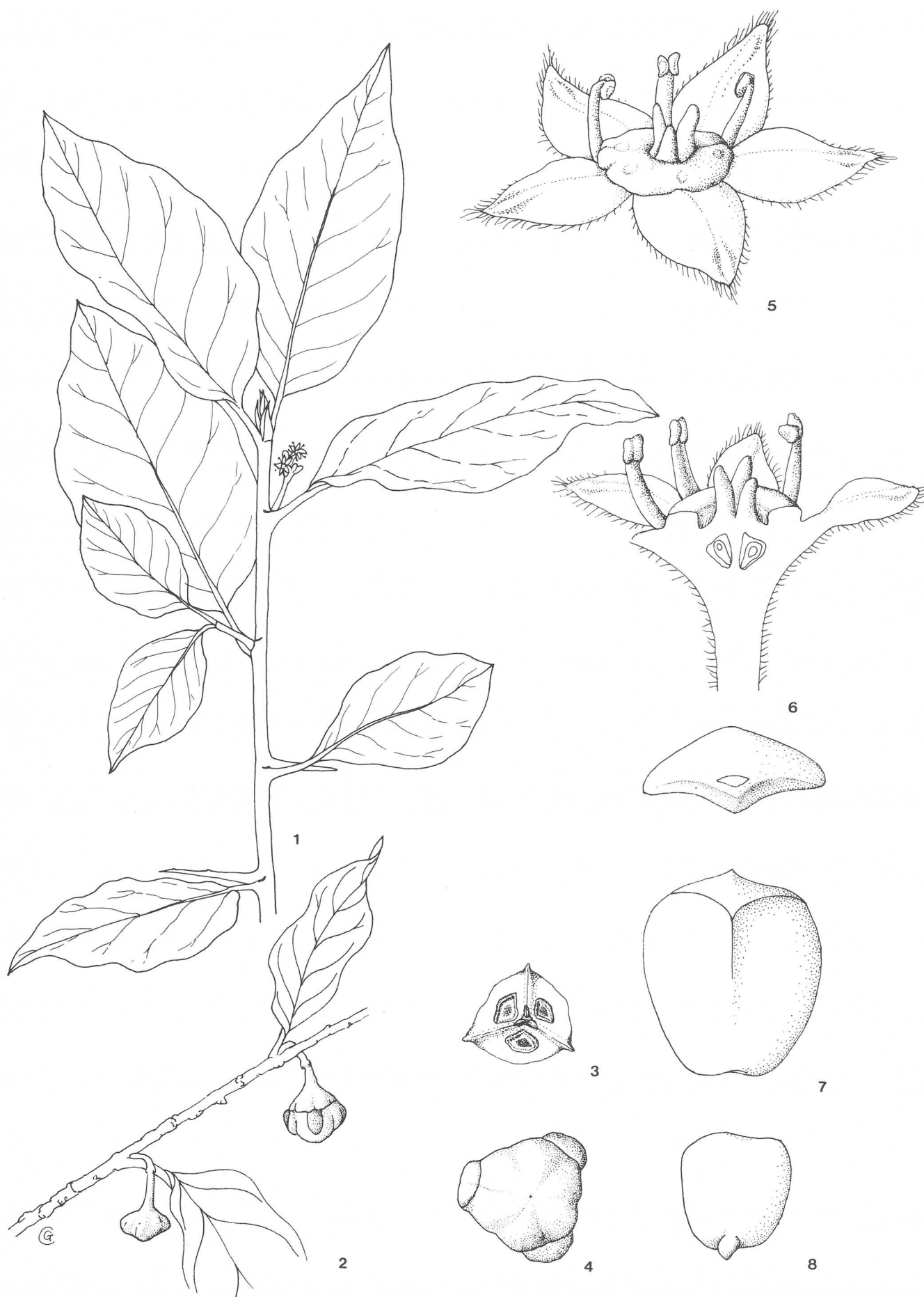
Figure 1 Colubrina nicholsonii . 1. flowering twig, \times 1 ; 2. fruiting twig showing an intact fruit and the fairly persistent remains of one dehiscent, \times 1 ; 3. Basal persistent part of capsule following dehiscence and showing three scars where the seeds were attached, \times 2 ; 4. fruit in apical view, \times 2 ; 5. flower with two stamens removed, \times 12 ; 6. flower, longitudinal section, \times 12 ; 7. seed, basal and ventral views, \times 5 ; 8. embryo, \times 5 (1, 5 & 6 from Schrire, Van Wyk & Abbott 1815; 2, 3, 4, 7 & 8 from Jordaan 326).