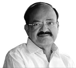
M VENKAIHAH NAIDU

The Jallianwala Bagh tragedy continues to rankle in every Indian's heart. Hundred years later, all nations must unite for a peace-based order and end terror