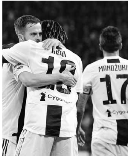
Moise Kean hugs Pjanic after scoring against AC Milan

Neymar has been out with an injured right foot sustained on January 23, but the 27-year-old was back in training on Thursday and PSG will be hoping he is fully fit for the April 27 French cup final against Rennes.