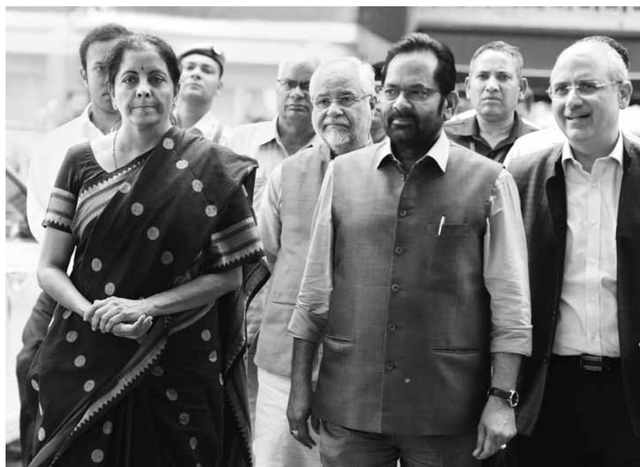
Nirmala Sitharaman and party leaders leave after meeting the Election Commission officials in New Delhi on Friday

"We have complained to the EC that neither the Supreme Court nor the Comptroller and Auditor General (CAG) have said anything of this kind. But the EC