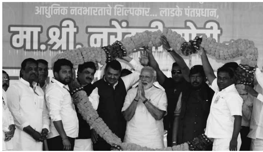
Prime Minister Narendra Modi with Maharashtra Chief Minister Devendra Fadnis, BJP candidate of the Nagar Constituency Sujay Vikhe Patil and other leaders at an election campaign rally in Ahmednagar on Maharashtra on Friday

Raking up Sonia Gandhi's Foreign national issue, Prime Minister Narendra Modi on Friday tore into NCP chief Sharad Pawar for teaming up with the Congress and standing by those leaders who are rooting for separation of Jammu & Kashmir from India and installation of a separate Prime Minister.