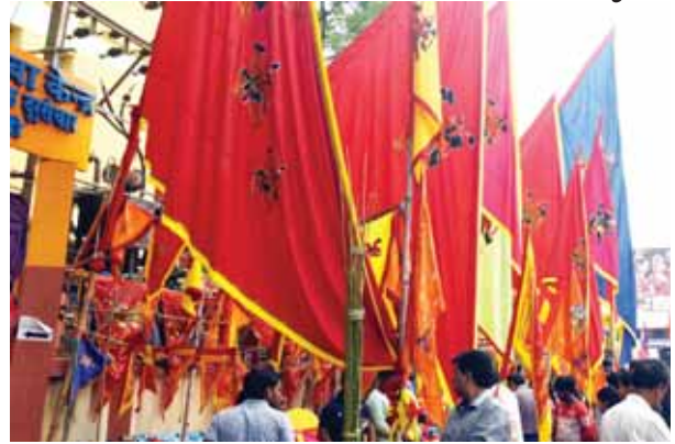
People purchasing Mahaviri flags on the eve of Ram Navami festival at road side in Ranchi on Friday

Ranchi is geared up to celebrate Ramnavami on Saturday and the streets are all decked up for the grand festival. Temple committees here are busy preparing their respective tableaus for the historic procession that has adorned the streets of the city every year since 1929. This year, the Sankat Mochan Sri Hanuman Mandir on Mahatma Gandhi Road has decided to offer an award of Rs.21,000 to the best tableau, Rs.15,000 to the runners up and Rs.11,000 to the second runners up. The grand display of war-craft will be one of the key attractions of the procession, and the devotees have been busy practicing at different Akharas across the city. While the tableaus will compete among each other, the city will also witness a competition among the flags. According to sources in temple committees, the devotees in the procession will carry a flag as tall as 51 meters this time around. The most popular tableaus will start from Mahavir Chowk, Sankat Mochan Sri Hanuman Mandir and Piska More. The district administration too has beefed up security to ensure a peaceful Ramnavami this year. Committees involved in organizing Ramnavami processions had to get their list of devotional songs approved by the local police station before playing them on loudspeakers. The police have also made it clear that any person found guilty of playing objectionable