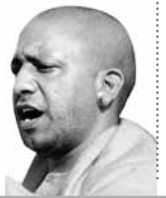
UP Chief Minister —Yogi Adityanath

Congress' manifesto is an encouragement to terrorism and Naxalism. Congress ka hath deshdrohiyo ke sath (Congress is hand in glove with anti-nationals).