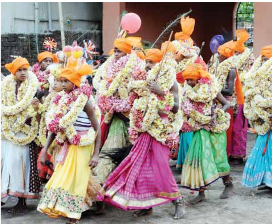
Devotees perform rituals ahead on Manda Puja festival in Ranchi on Friday. Manda is a unique festival celebrated by both tribal and non-tribal communities of Jharkhand. Tedious rituals such as walking bare footed on burning coal, hooking one's body with iron-hooks and hanging on high-poles called Charka Dag Machan, are included in this festival. This fair is usually organised at night