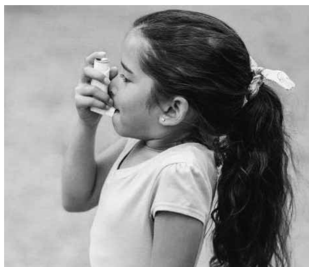
The estimates suggested that there are 170 new cases of traffic pollution-related asthma

Worldwide four million kids get asthma every year as a result of inhaling air pollution, said the study conducted by researchers at the George Washington University Milken Institute of Public Health. And an estimated 64 per cent of these new asthma cases occur in urban areas. The study based on the data between 2010 and 2015 is published in The Lancet Planetary Health journal.