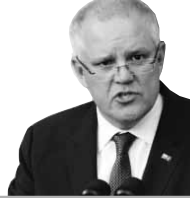
Australian Prime Minister —Scott Morrison

Assange will get the same support that any other Australian would ... he's not going to be given any special treatment.