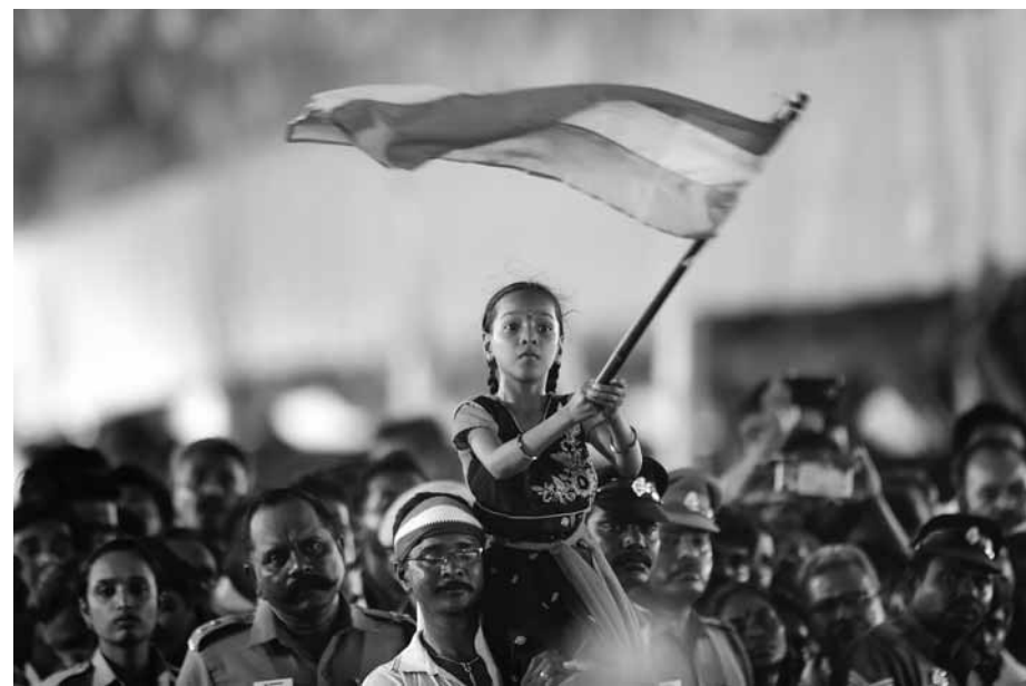
Congress party supporters at a rally by party president Rahul Gandhi during the ongoing general elections in Salem on Friday