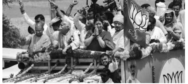
Chaturvedi's swipe at her qualifications through a spoof on her hit TV serial.

Amethi (UP): Union Minister Smriti Irani on Friday hit back at the Congress over its allegations that she "falsified records" of her educational qualifications, saying she will continue to work hard for Amethi no matter what its leaders say.