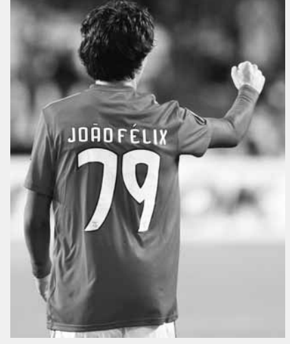
Benfica's Joao Felix celebrates after completing his hat-trick against Eintracht Frankfurt. The 19-year-old Joao becomes the youngest ever player to score a Europa League hat-trick and he also set up the other goal in his side's 4-2 win