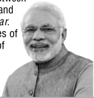
Prime Minister —Narendra Modi

You have to choose between imaandar chowkidar and bhrashtachari naamdar . Choose between heroes of India and supporters of Pakistan.