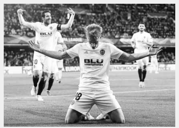
Valencia's Daniel Wass celebrates after scoring via assist from Jose Gaya during the UEFA Europa League first leg quarter final against Villarreal UEL

Ruben Dias made it three when he headed in Felix's flick-on from a corner, and the 19-year-old side-footed home Alex Grimaldo's cross to complete his treble nine minutes into the second half, before Goncalo Paciencia pulled one back with his head from a corner to keep the tie alive.