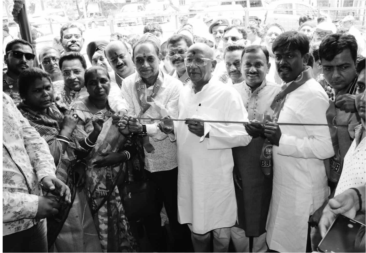
Food and Civil Supplies Minister Saryu Roy and BJP candidate from Jamshedpur Bidyut Baran Mahto inaugurating party's office in Jamshedpur

"The office would help people as they can complain