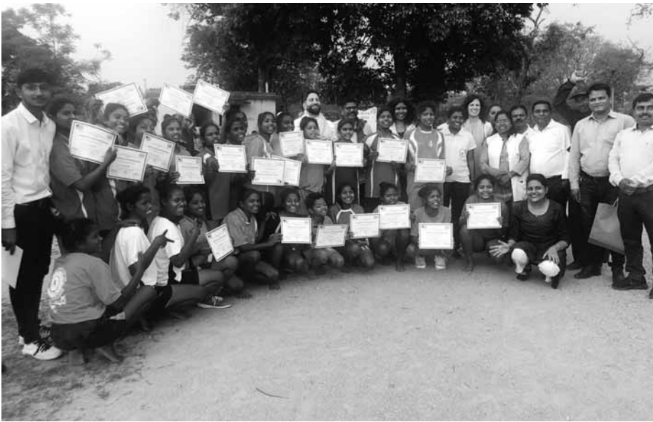
Hockey players from interior areas of Jharkhand with the team of US Consulate in Khunti on Friday