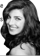
Actor —Priyanka Chopra

We always had a voice. Just nobody heard us. Now because of the support we're giving each other, nobody can shut us down. That's an incredibly powerful thing.