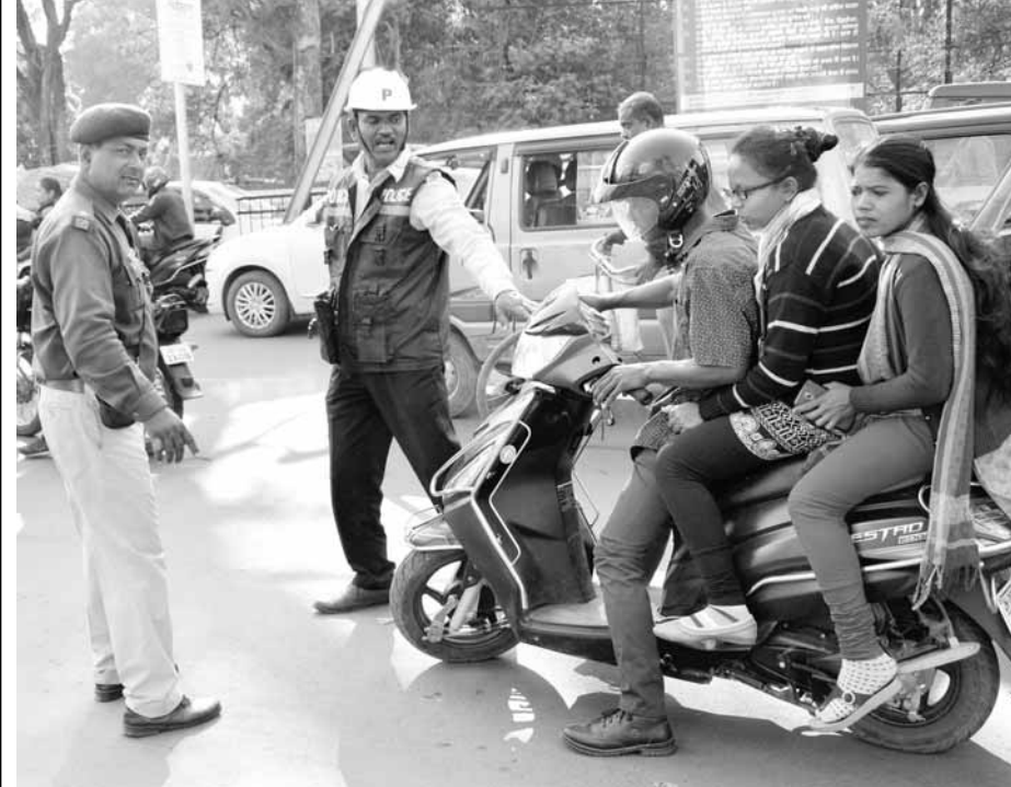
A traffic violation checking drive being conducted in Ranchi on Friday