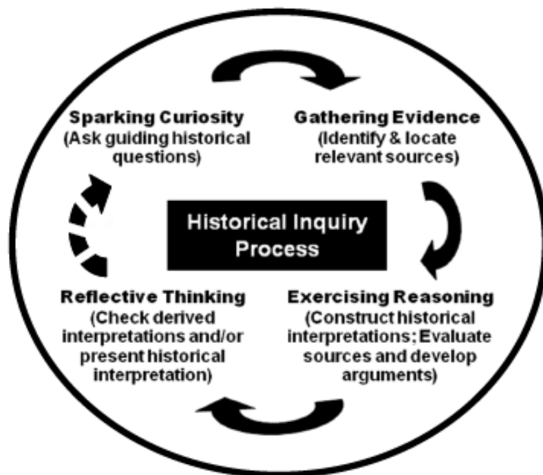
Figure 2.1a: Cycle of Historical Inquiry

History provides us a way of thinking about the past. The use of historical inquiry shows students a way to inquire into, organise and explain events that have happened. Historical inquiry is the process of “doing history”. It is a cyclical process ( Figure 2.1a ) that begins with the asking of guiding historical questions. This is followed by locating and analysing historical sources to establish historical evidence. The historical evidence is then used to construct historical interpretations that seek to answer the guiding historical questions. 2