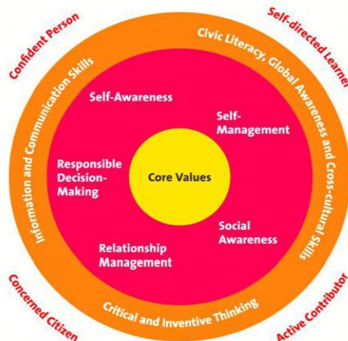
Figure 1.4a: Framework for 21 st Century Competencies and Student Outcomes 1

Through this process and working with historical information and evidence, students will develop an awareness of the histories of societies and how key forces and developments have shaped these histories to the present. By analysing and evaluating information and evidences, students learn to think critically using the skills of investigation to extract, order, collate, synthesise and analyse information to formulate and test a hypothesis and reach a conclusion on issues explored in the syllabuses.