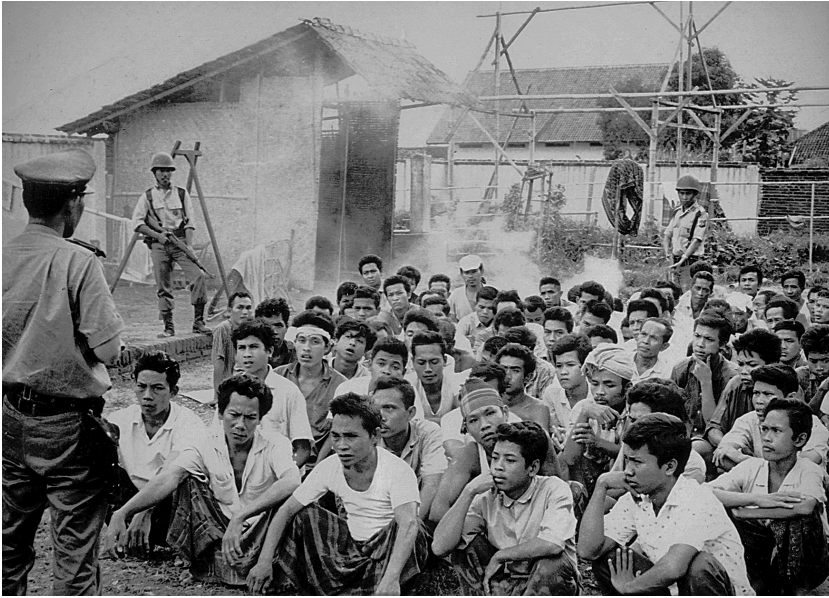
FIGURE 1.2. PKI members and sympathizers detained by the army in Bali, ca. December 1965.

in the populous provinces of Central and East Java, on the island of Bali, in Aceh and North Sumatra, and in parts of East Nusa Tenggara. By contrast, they were relatively limited in the capital city of Jakarta, the province of West Java, and much of Sulawesi and Maluku. The timing of the killing was also distinctive. It began in Aceh in early October, and spread to Central Java in late October and to East Java and North Sumatra in early November. In December 1965, a full two months after the alleged coup attempt, the violence finally started in Bali, where an estimated eighty thousand people were killed in a few months. Meanwhile, on the largely Catholic island of Flores toward the eastern end of the archipelago, it did not begin until February of the following year. The violence started to slow significantly in March 1966, shortly after the army seized power, but continued intermittently in some parts of the country through 1968. 5 As discussed below, one of the enduring questions about the violence has been how to explain these variations.