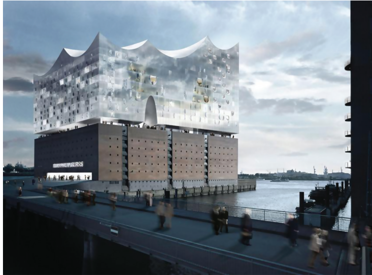
Figure 5. Herzog & de Meuron, Elbe Philharmonie. Copyright Herzog & de Meuron.

bind of both/neither—expose a tension that cannot be described in terms of the modern or the postmodern, but must be conceived of as metamodernism expressed by means of a neoromanticism. 39 If these artists look back at the Romantic it is neither because they simply want to laugh at it (parody) nor because they wish to cry for it (nostalgia). They look back instead in order to perceive anew a future that was lost from sight. Metamodern neoromanticism should not merely be understood as re-appropriation; it should be interpreted as re-signification: it is the re-signification of “the commonplace with significance, the ordinary with mystery, the familiar with the seamliness of the unfamiliar, and the finite with the semblance of the infinite”. Indeed, it should be interpreted as Novalis , as the opening up of new lands in situ of the old one.