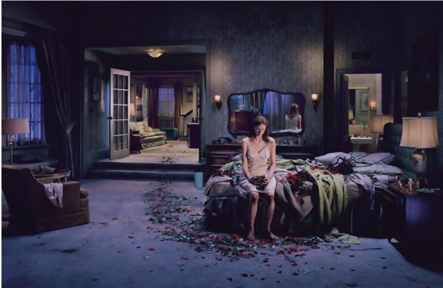
Figure 4. Gregory Crewdson, Untitled (2004). Photograph.

because architecture cannot but be concrete. The works of “starchitects” Herzog and De Meuron are exemplary here. Their more recent designs express a metamodern attitude in and through a style that can only be called neoromantic. A few brief descriptions suffice, here, to get a hint of their look and feel. The exterior of the De Young Museum (San Francisco, 2005) is clad in copper plates that will slowly turn green as a result of oxidization; the interior of the Walker Art Center (Minneapolis, 2005) holds such natural elements as chandeliers of rock and crystal; and the façade of the Caixa Forum (Madrid, 2008) appears to be partly rusting and partly overtaken by vegetation. While the above examples are appropriations or expansions of existing sites, their recent designs for whole new structures are even more telling. The library of the Brandenburg Technical University (Cottbus, 2004) is a gothic castle with a translucent façade overlain with white lettering; the Chinese national stadium (Beijing, 2008) looks like a “dark and enchanted forest” from up close and like a giant bird’s nest from a far 38 ; the residential skyscraper at 560 Leonard street (NYC, under construction) is reminiscent of an eroded rock; the Miami Art Museum (Florida, under construction) contains Babylonian hanging gardens; the Elbe Philharmonic Hall (Hamburg, under construction, see Figure 5) seems to be a