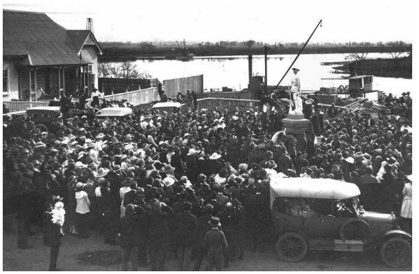
Anzac Day - Gladstone War Memorial.

See Gladstone War Memorial. This memorial to WW1 fallen sons of the Gladstone area was unveiled on 6th August 1920. Each year Anzac Day