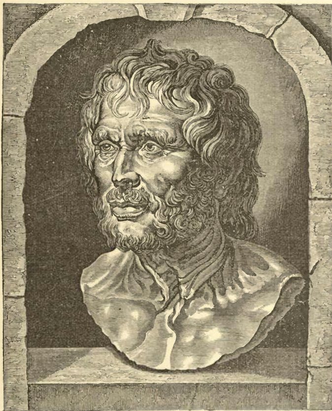
LUCIUS ANNÆUS SENECA.