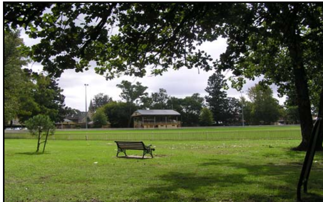
PHOTO 6: Richmond Park – view of oval and pavilion “...a long association with cricket” and “historic resonance of restored pavilion” [CMP 2003] (06/04/2009).