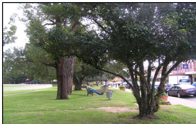
PHOTO 1: Richmond Park – view looking west along Windsor Street frontage with shops [right background] (06/04/2009).

NOTE: Condition of cultivated trees [native & exotic]* varies throughout the park. Some trees display physical damage, dead wood, cavities/ insect damage and should be inspected by a qualified arborist.