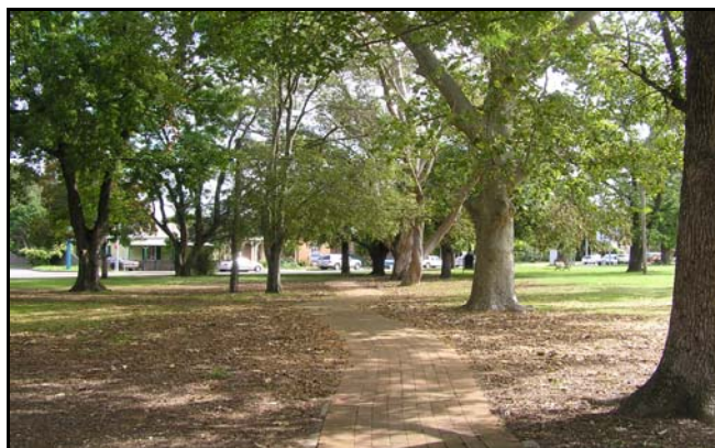
PHOTO 11: The south-east corner of the park was lost to rail development for almost 30 years. The existing sinuous pathway and signage will be replaced with a more accurate interpretation of the former rail alignment (06/04/2009).