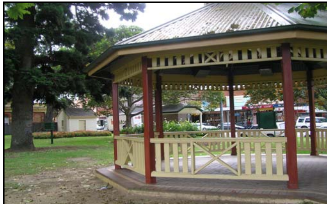
PHOTO 10: The 'antique-style' rotunda, installed in 2002, has little local significance. The park has experienced considerable development in recent decades (06/04/2009).