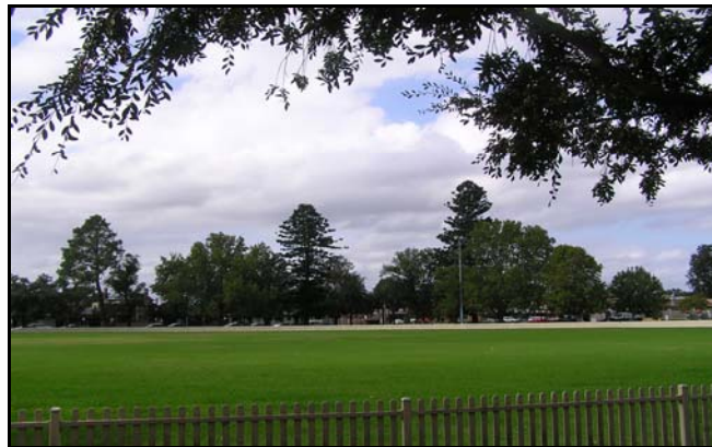
PHOTO 15: Richmond Park – The Plan of Management aims “to conserve, manage and enhance the park’s cultural heritage and mix of sporting and passive recreational opportunities”.

“To ensure appropriate protection, conservation and sustainable management of the park’s landscape setting, its rich cultural heritage, social and recreational values in accordance with the objectives of community land management for the benefit of the broader community and for future generations”.