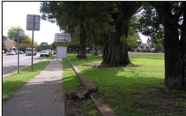
PHOTO 3: Richmond Park – view looking west along March Street frontage showing damaged brick edging (06/04/2009).