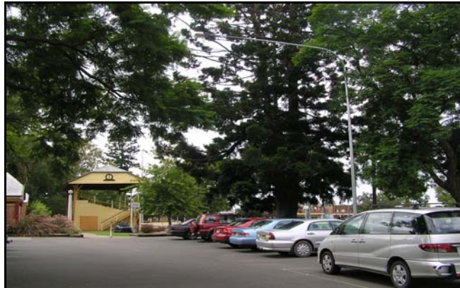
PHOTO 12: This Hoop Pine [right background] is part of an historic collection of these native Araucarias – originally planted with Bunya Pines (long removed) (06/04/2009).