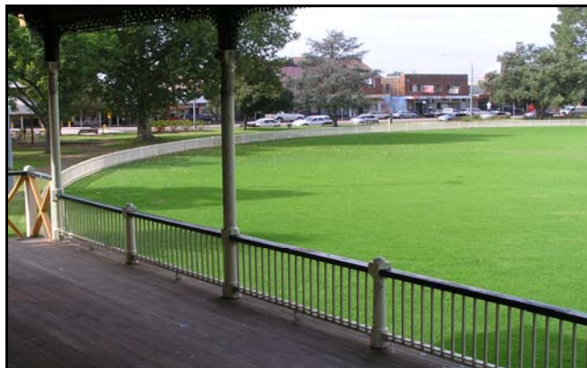
PHOTO 4: Richmond Park – view from pavilion (built 1883/ restored 1993-94) looking north-east over the oval (06/04/2009).