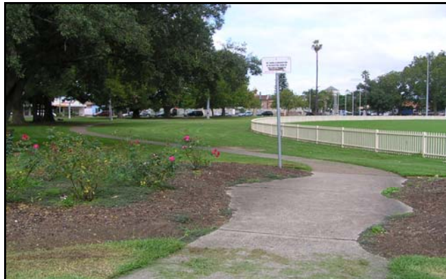
PHOTO 9: View looking south-east near Windsor Street – early gravel pathways around the oval, linked to key entry points, have long disappeared. Existing pathways are ad hoc (06/04/2009).