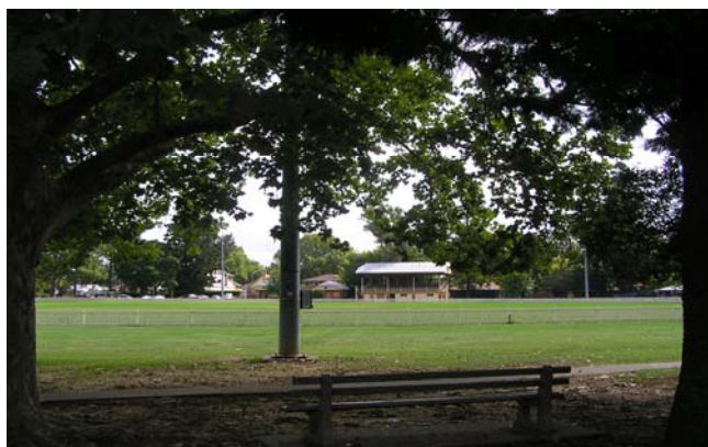
PHOTO 14: A phased program of replacement tree planting needs to be consistent with the planting palette and layouts established in the late 19 th / early twentieth century (06/04/2009).