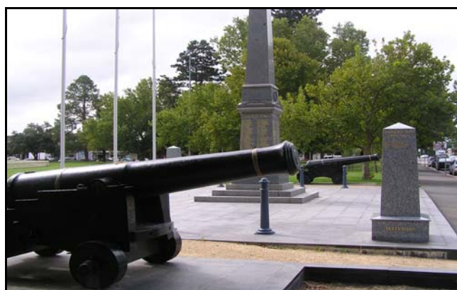
PHOTO 2: Richmond Park – view of WWI memorial looking north along East Market Street (06/04/2009).