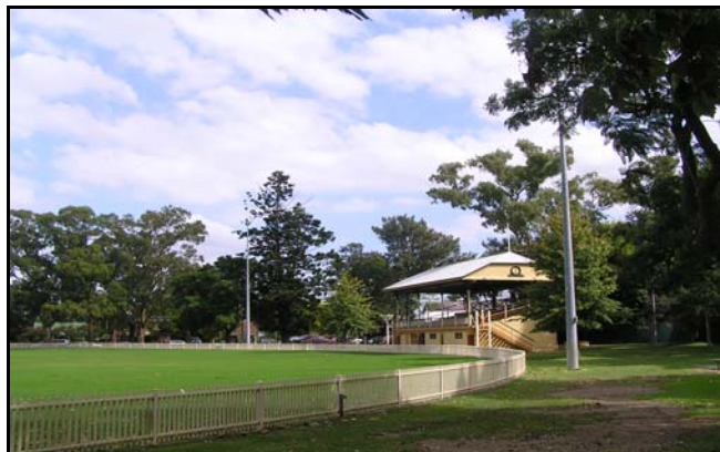
PHOTO 7: Richmond Park retains key elements from its 1860s -80s layout – the oval/ pavilion and an outstanding collection of significant trees along the park boundaries (06/04/2009).