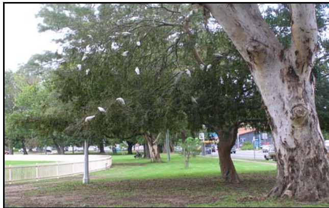
PHOTO 13: The ageing population of significant trees, like this magnificent River Red Gum [right foreground], needs appropriate arboricultural care and management (06/04/2009).