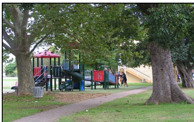
PHOTO 5: Richmond Park – view of children's playground and heritage trees incl. Red Cedar [right foreground] (06/04/2009).