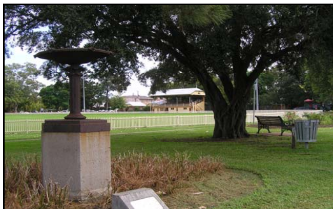
PHOTO 8: Cast-iron fountain on plinth (1892) [left foreground] & African Olive (c.1860s-1870s) [right background] (06/04/2009).