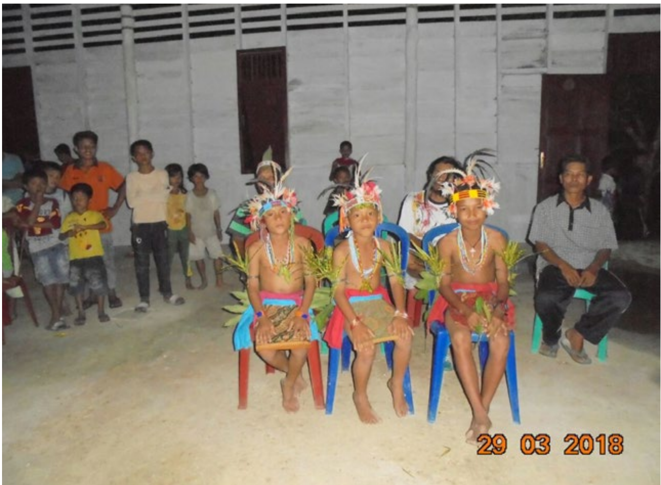
Students from the Studio Pumaijat team (Saibi Samukop) worked with YPSM to socialise