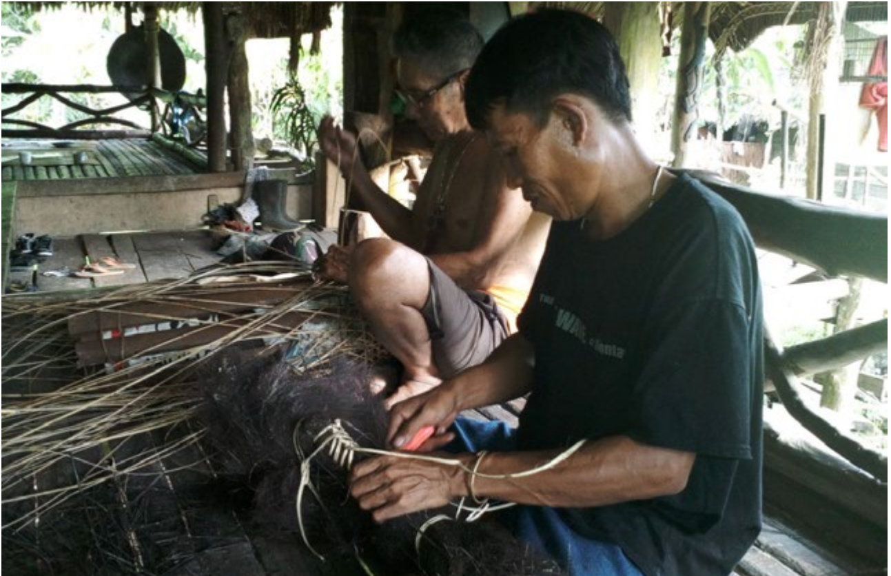
Handcraft activities teaching how to make a woven basket (Opa)