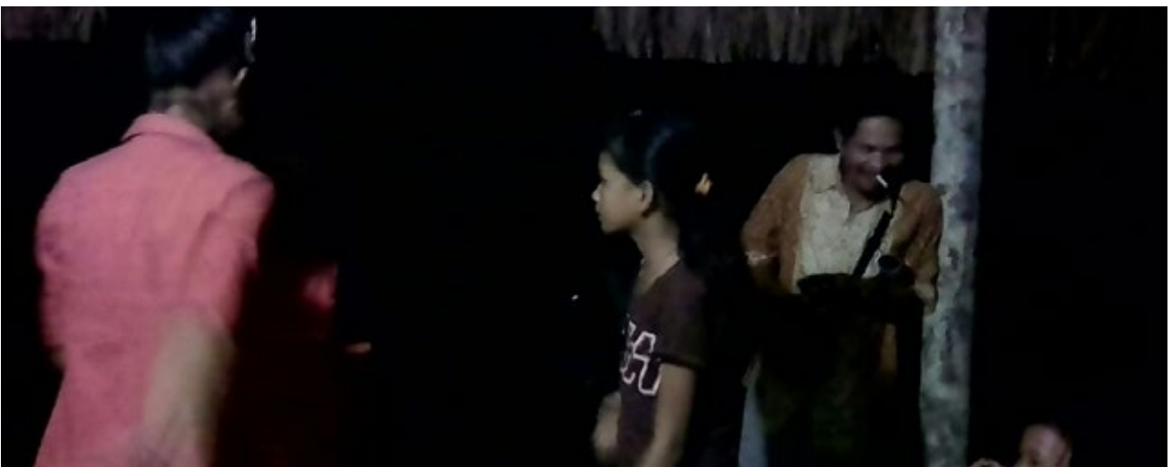
Female students learning the ceremonial dance