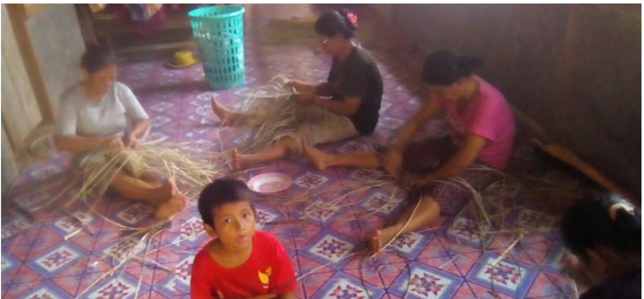
Mother-to-Mother cultural activity