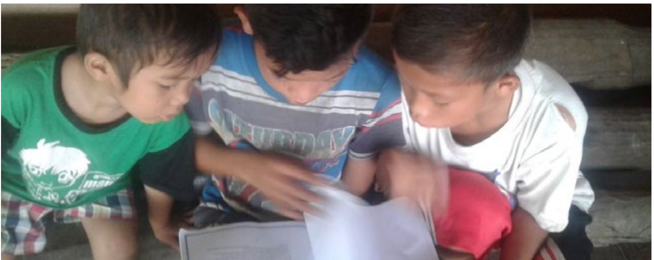
Students learning the program's curriculum