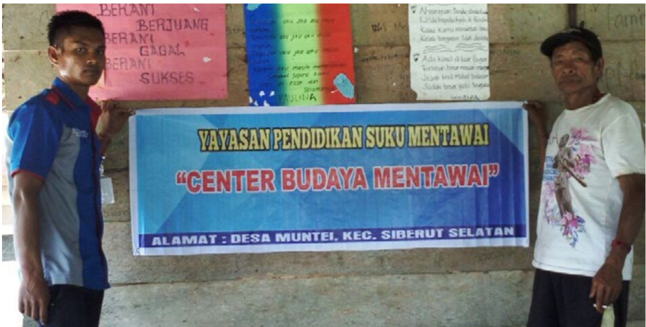
Erecting the Mentawai Cultural Learning Centre banner

We have developed plans to construct a Cultural Learning Centre to enable us to achieve our objectives for the YPSM program. Our proposal has been sent to IEF, who are assisting in reaching out for funding support. In the meantime, we have established an agreement with a local member of the Muntei community to utilise his Uma as a temporary space. We are currently setting up the space.