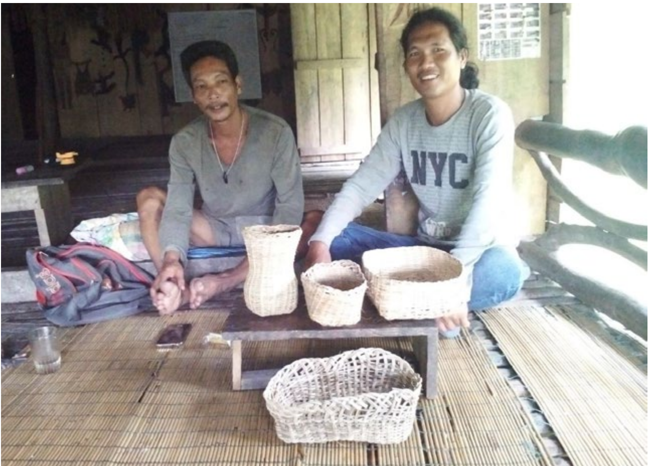
Results of the hand craft activities