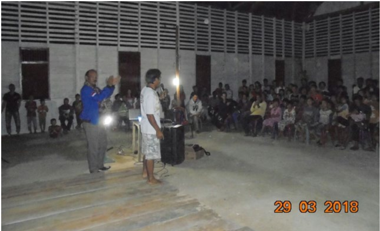
The chairman of Pumaijat studio provides lessons on the importance of maintaining Mentawai Culture and environment