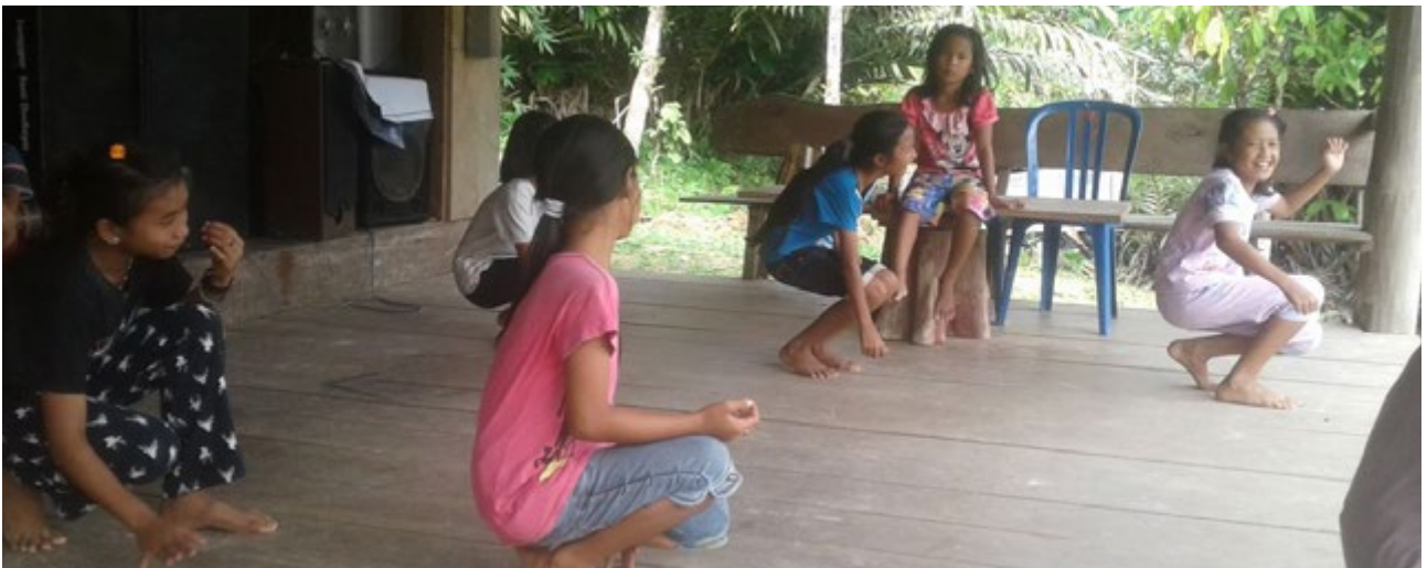
Female students practice ceremonial dance