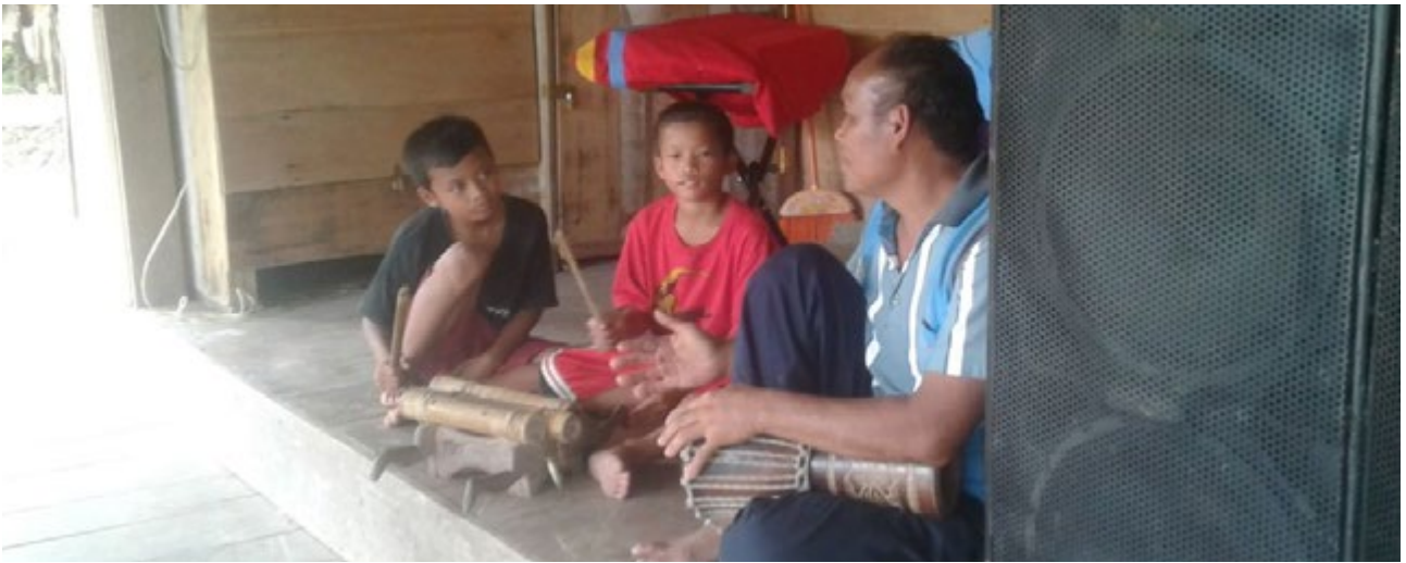
Students learning cultural music