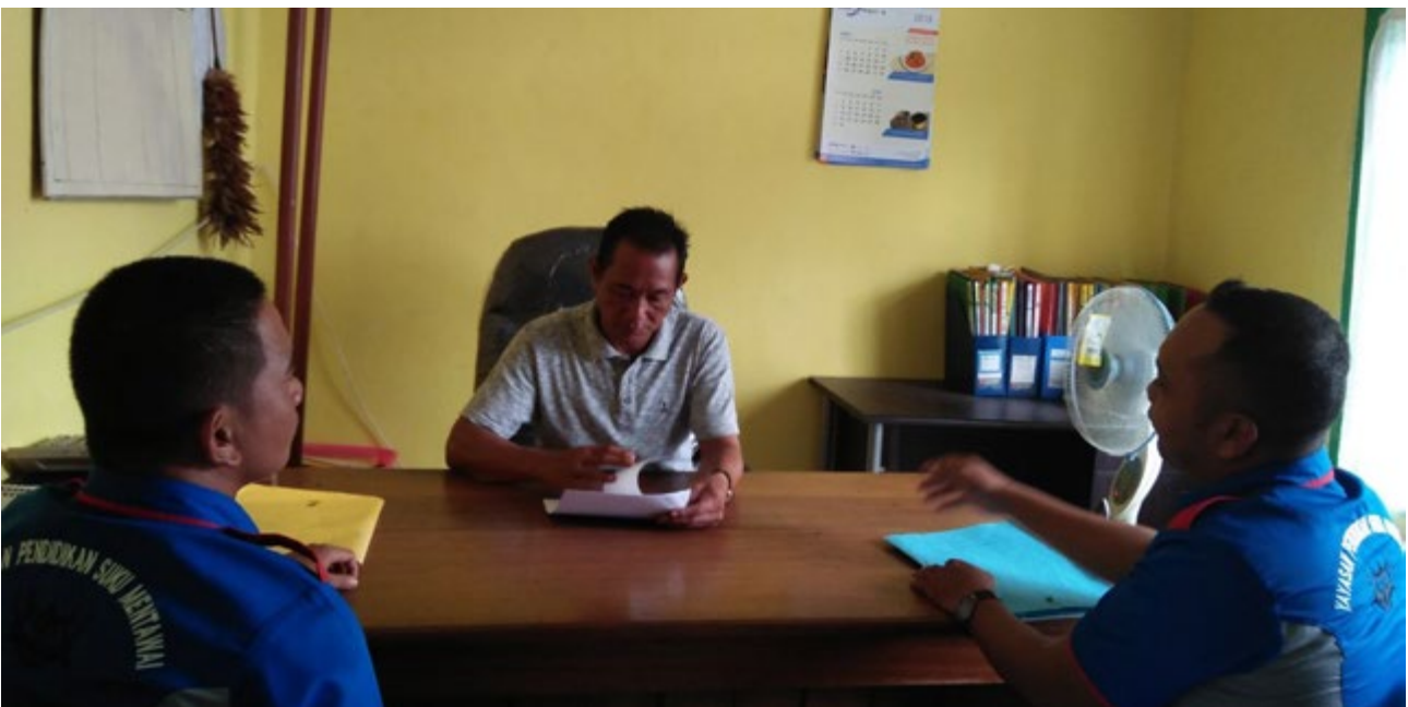
YPSM meeting with the head of Education, Southern Siberut Branch to discuss the proposed Festival