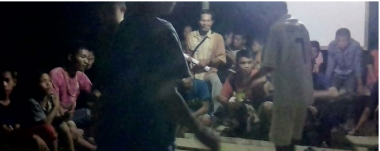
Students perform cultural dance for the audience