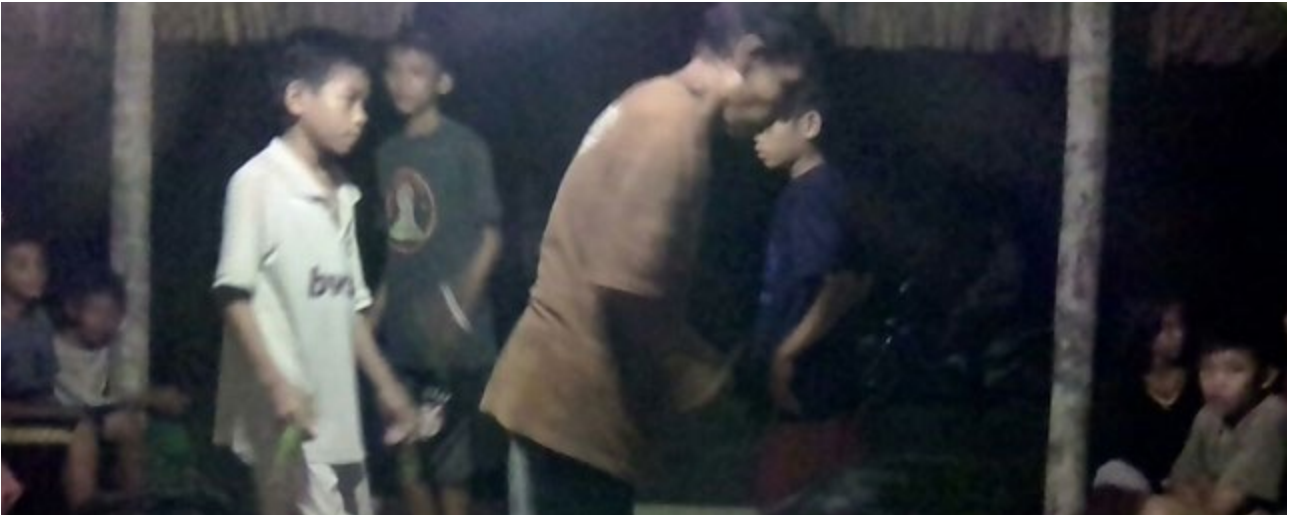
Male students learning ceremonial dance