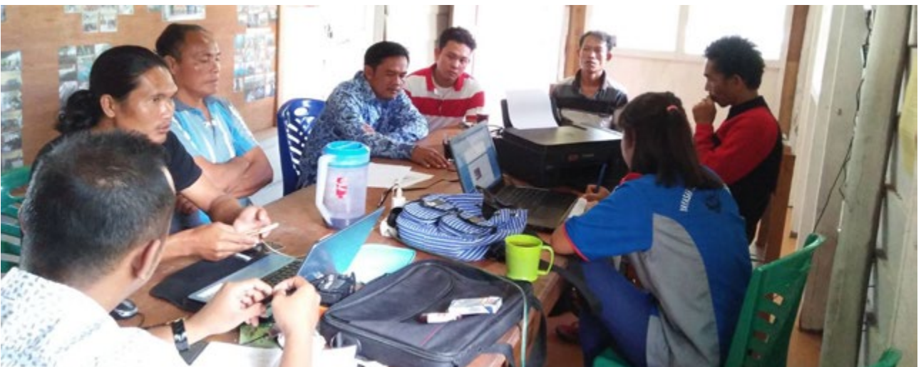
YPSM meets with committee members from cultural studios, Malinggai uma, Jaraik sikerei and Culture Learning Center to discuss strategic planning