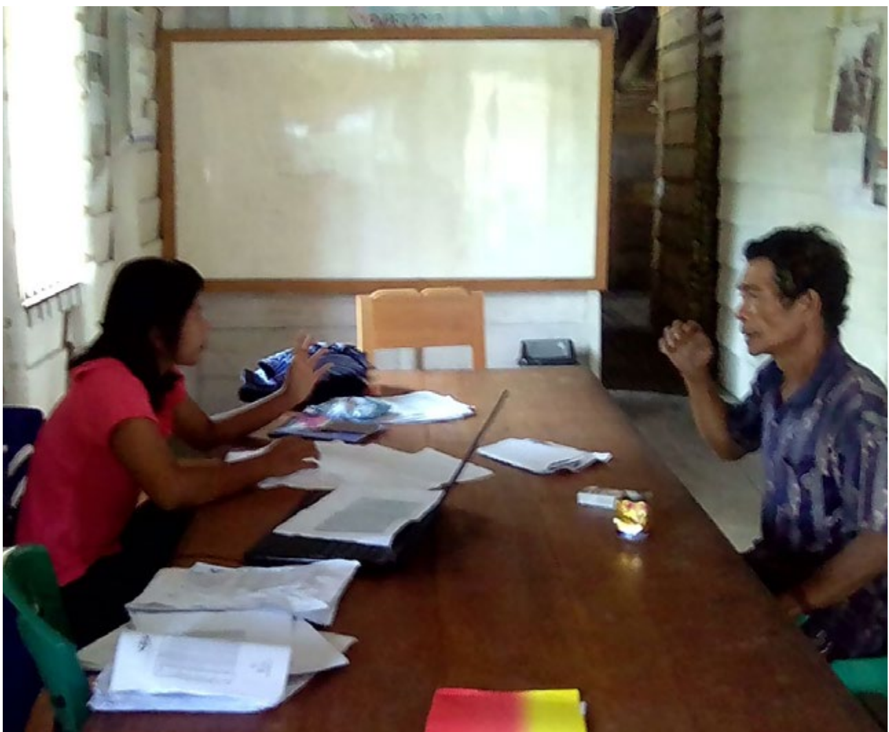
YPSM Research division amidst discussion concerning how to Inaugurate Mentawai Traditional House (Uma) with a Cultural Ritual Ceremony (Gurut Uma)