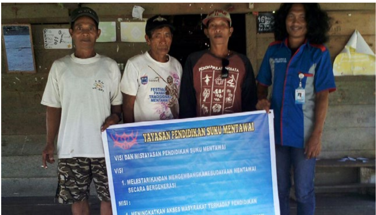
Erecting a banner with YPSM and the cultural program's vision and mission