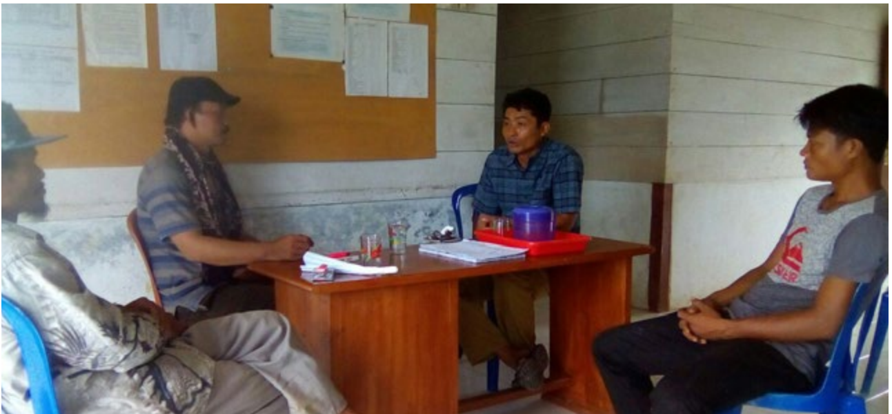
Chairman of YPSM and Chairman of Pumaijat Studio discuss with Head of Cimpungan Village