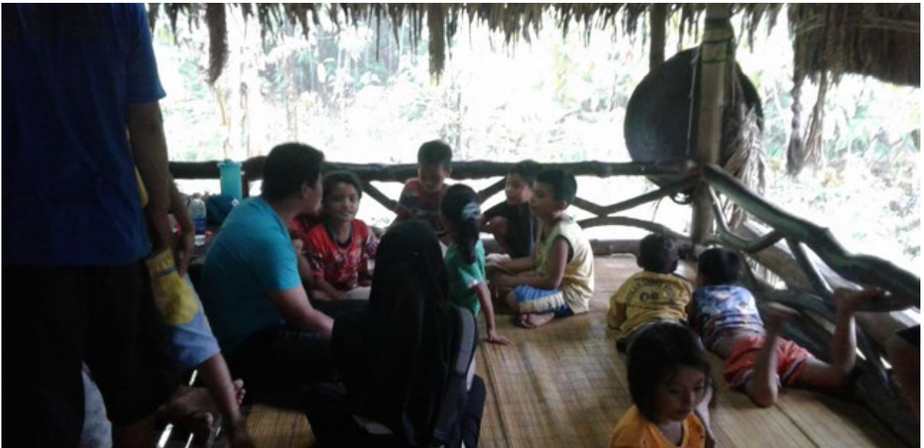
Students learning about Mentawai cultural dance and types of cultural accessory