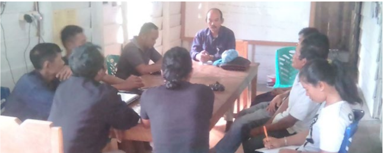
YPSM team meet to discuss the cultural studios and program