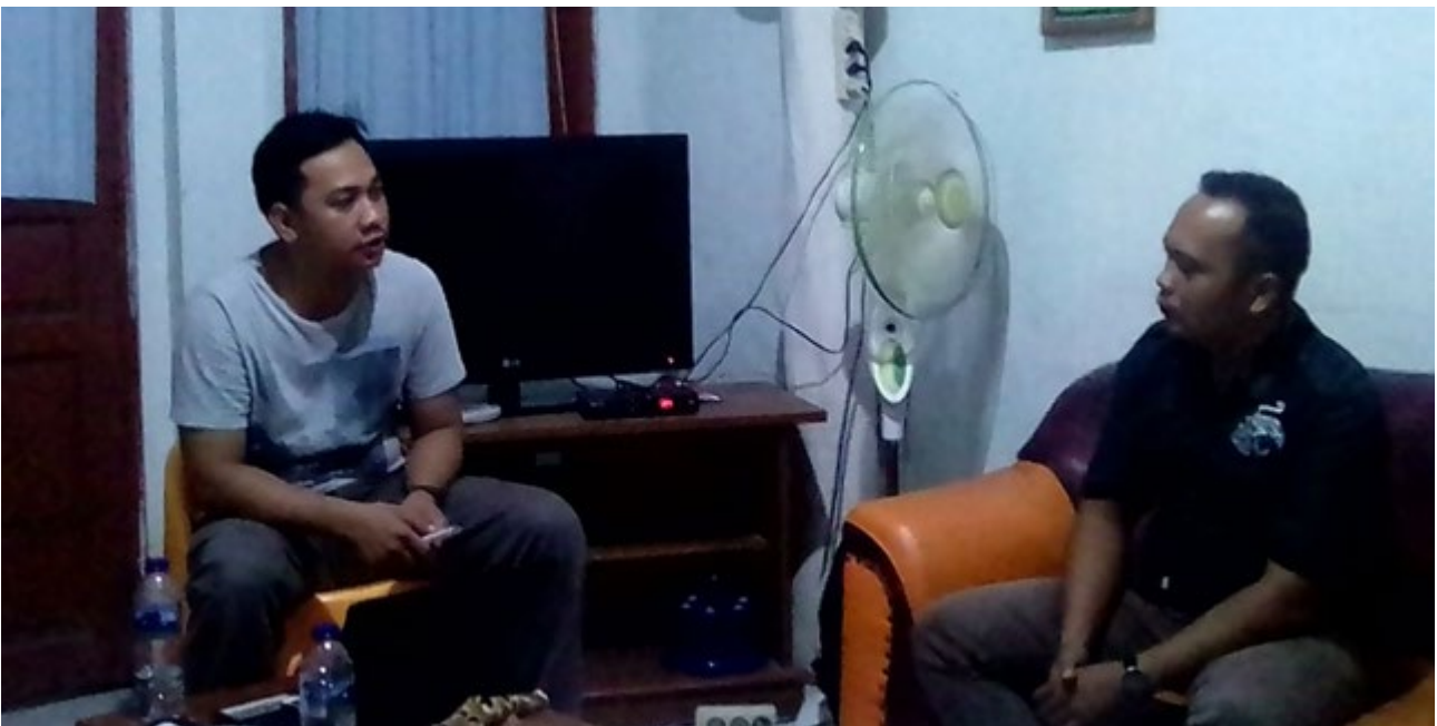
YPSM and YCM discuss the Implementation Plan of Cultural Performances of Nusantara Festival, to be celebrated in Muntei, Southern Siberut Island.

YPSM are in discussion with other Mentawai organisations and departments to develop Islander Cultural Performances Festival in Muntei village in August, 2018. This collaboration will involve Yayasan Citra Mandiri (YCM), Muntei village Government, South Siberut Government, YPSM and each individual cultural studio who will participate. To progress, we will send an official invitation to those involved to gather together and discuss at an upcoming meeting. We shall report further on this after the meeting has been held.