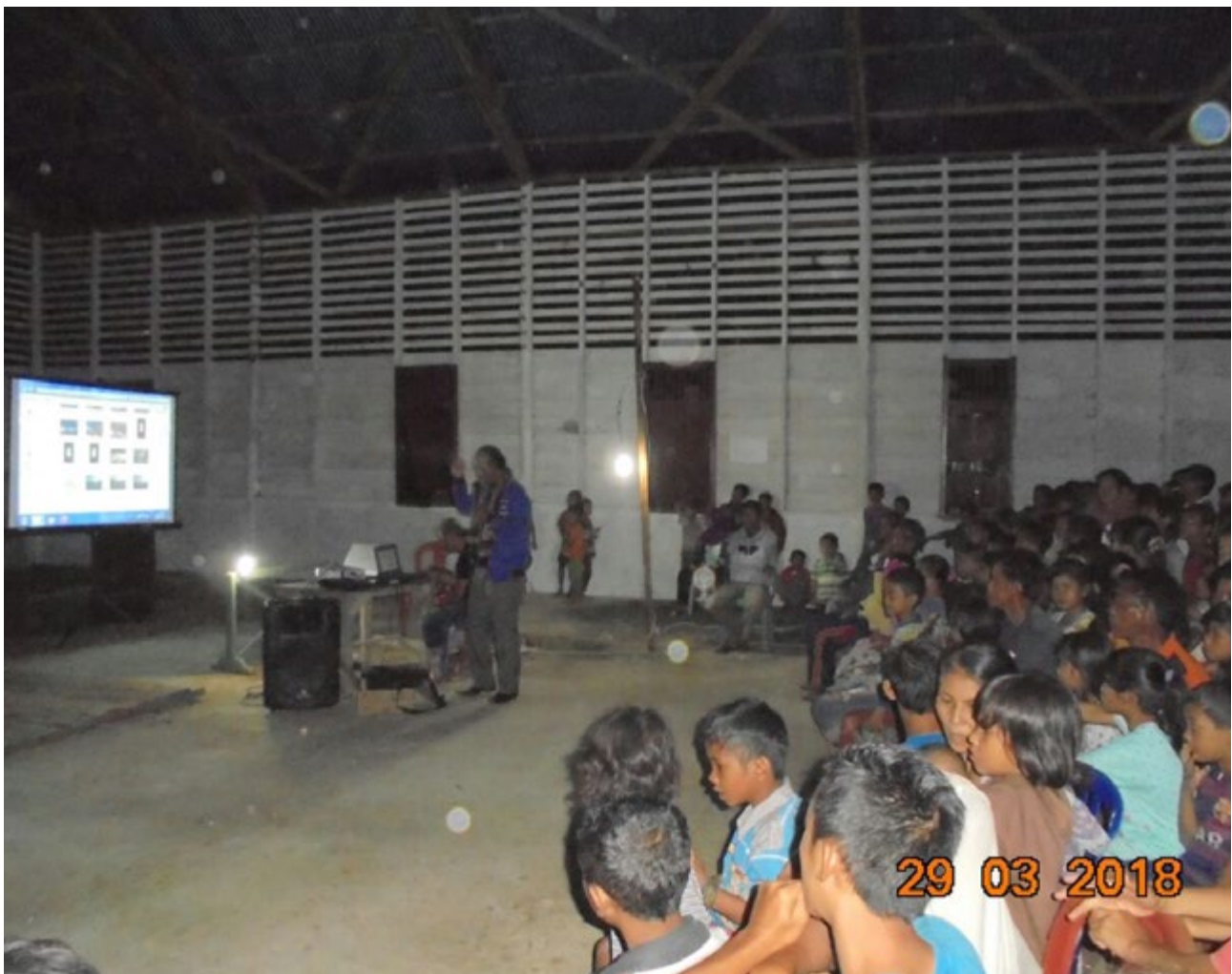
Team YPSM present the cultural program to the Cimpungan community

As a concrete proof of the support for YPSM and our objectives, when we host the socialisation / studio events in each village we always have high levels of attendance. The enthusiasm of the community is remarkable. Our mission to to build a cultural school in every Mentawai district continues and has the support and collaboration of the South Siberut Education Branch Office and Central Siberut Education Branch Office.