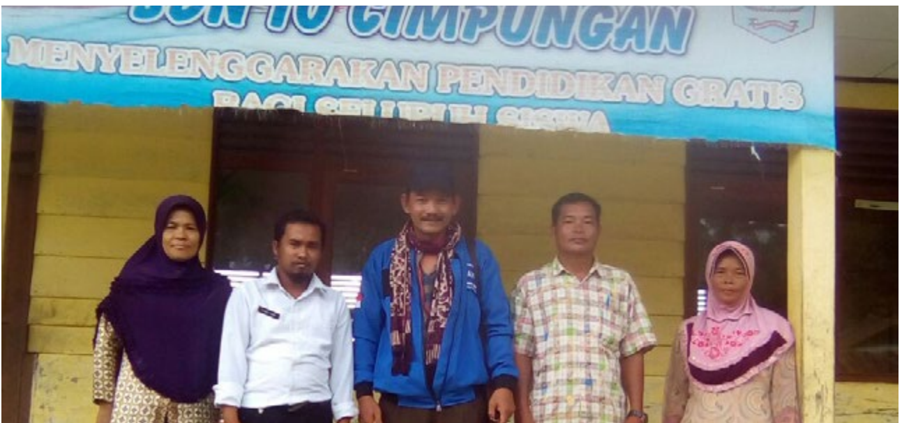
YPSM Chairman Photographed with SDN 10 Cimpungan School Parties