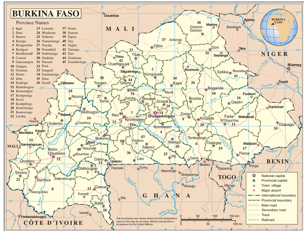
Figure 1. Map of Burkina Faso