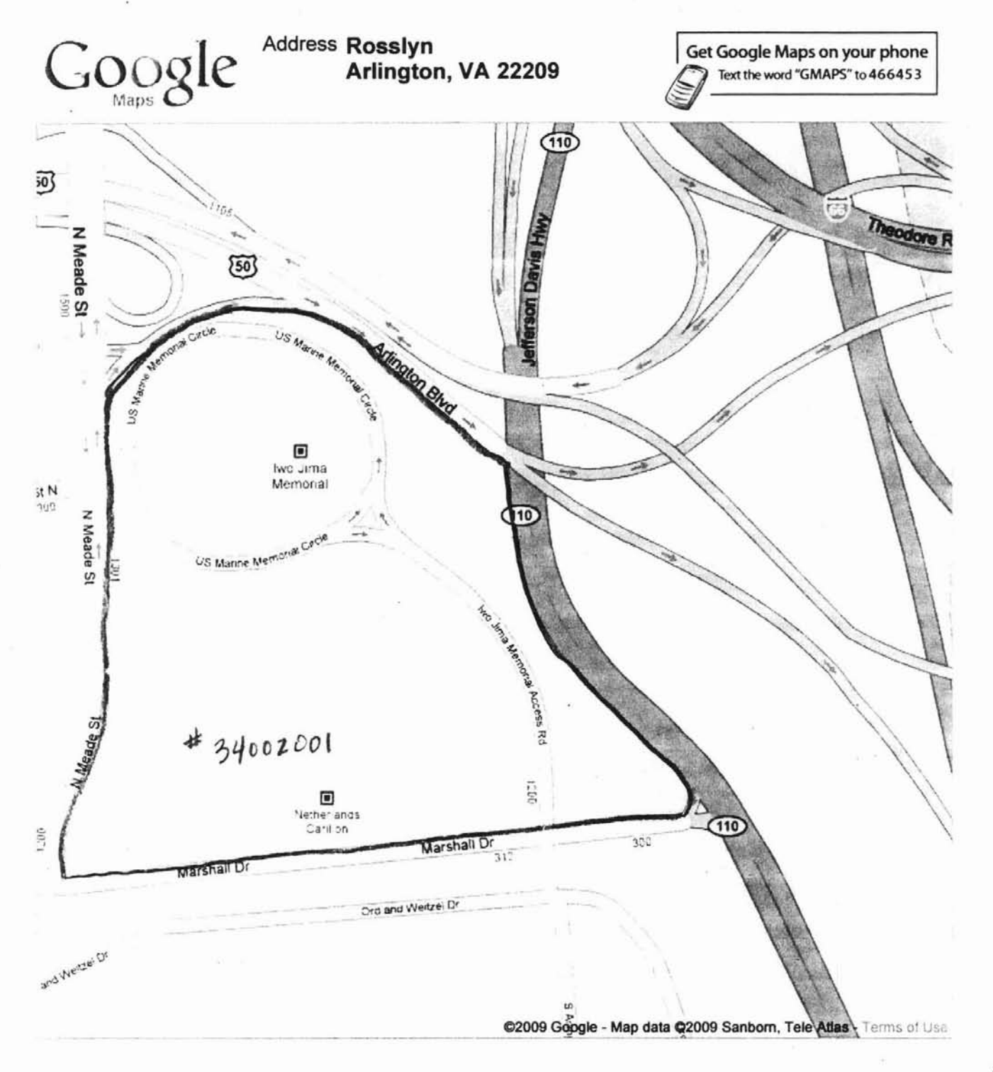
PROUNDARY FOLLOWS INNER EDGE OF N.MEADE ST (N) THEN EXIT OFF TO ARLINGTON BLVD. (E) THEN ALONG RTE 110, JEFFERSON DAVIS HUY (S) THEN EXIT OFF TO MARSHALL DRIVE (W) BACK TO N MEADE ST