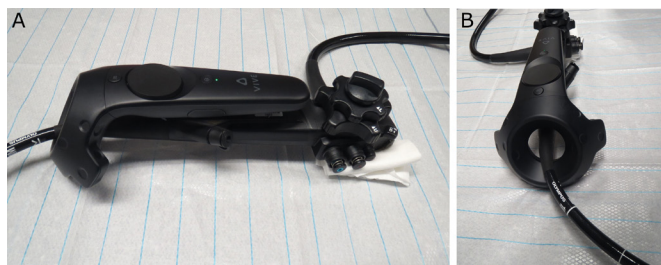
Figure 1 Virtual reality-controller mounted on a regular gastroscope.

that brighter areas are closer to the light source of the endoscope, we were able to generate 3D images using the regular 2D endoscopic image. After generation, we slowly tilted the 3D image to improve the perception of the mucosal surface. This method especially helped us to classify polyps using the Paris classification (figure 4).