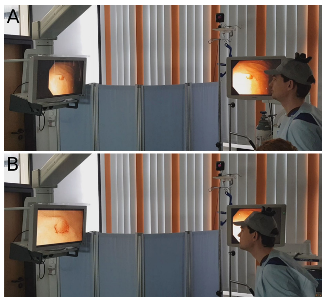
Figure 3 Intuitive zoom applied during gastroscopy. (A) Depicts the room setup with the monitor on left side and the examiner with the tracking device on his head on the right side. (B) Forward movement of the head results in a stepless magnification of the endoscopic image in the area of interest.

polyps during real-time colonoscopy. 15 This feature will also improve training by teaching young gastroenterologists to focus on specific regions without disturbance of the remaining endoscopic image. The latter group might also benefit from the 3D reconstruction of the mucosal surface. A 3D volume of a polyp in VR is presumably more easily to classify using the Paris classification instead of using a 2D image. Additionally, interaction with 3D polyps in VR might be implemented into a VR endoscopy training platform.