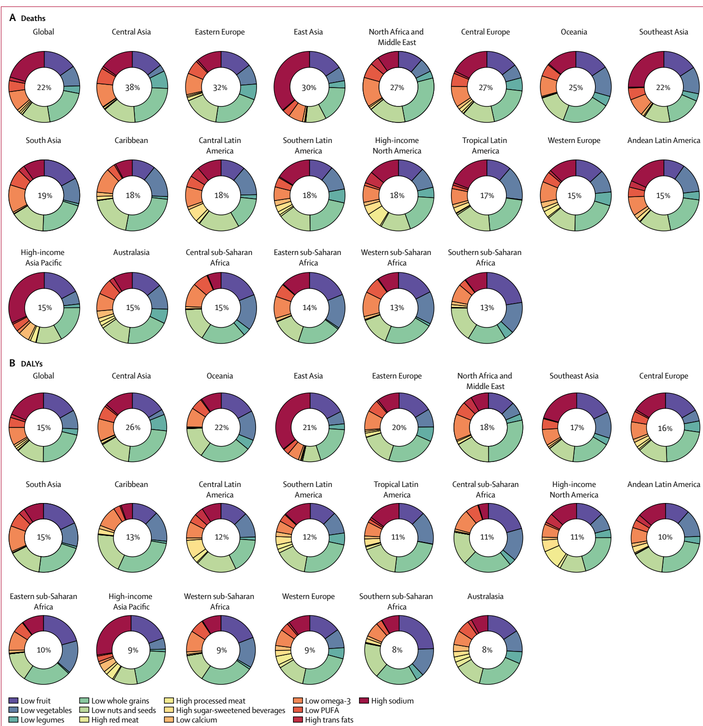
Figure 4: Age-standardised proportions of deaths and DALYs attributable to individual dietary risks at the global and regional level in 2017. DALYs=disability-adjusted life-years.

The lowest burden of exposure to dietary risk was observed in high SDI countries (139 [129–148] deaths per 100 000 population and 3032 [2802–3265] DALYs per 100 000 population). Low-middle SDI had the highest age-standardised rates of diet-related deaths and DALYs