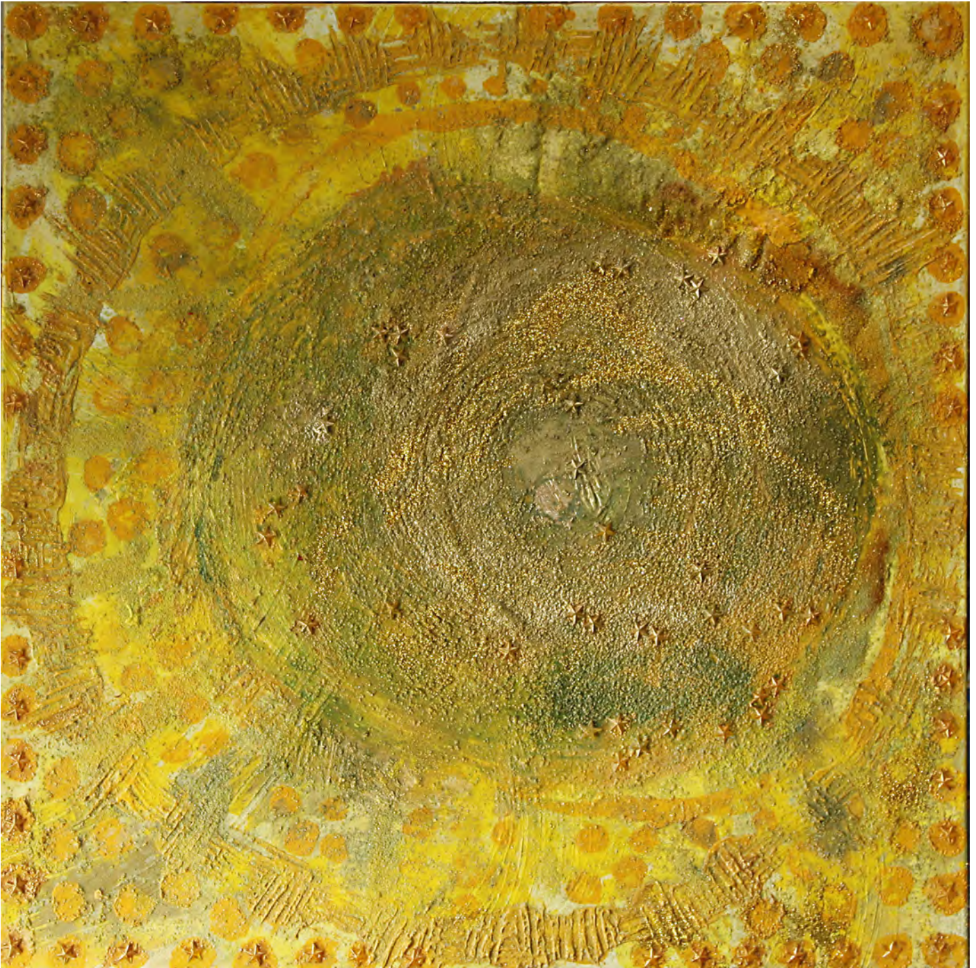
Great Central Sun, Structure of Delight mixed media with gold-leaf 100 x 100 cm, 2014

I am the Victorious One Success is the seed of my soul the stars are the stuff we are made of