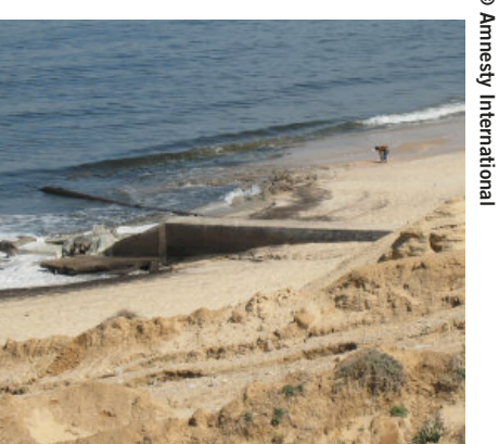
WATER INFRASTRUCTURE DESTROYED

During the 22-day Israeli military offensive in December 2008-January 2009 (Operation "Cast Lead"), Israeli attacks caused some US$6 million worth of damage to water and wastewater infrastructure in Gaza. Four water reservoirs, 11 wells, and sewage networks and pumping stations were damaged and 20,000 metres of water mains were damaged or destroyed by Israeli tanks and bulldozers. Sewage treatment plants in north and central Gaza were damaged, resulting in raw sewage flooding more than a square kilometre of agricultural and residential land, destroying crops and causing a health hazard.