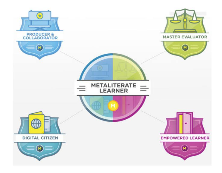
Fig. 3. The Metaliteracy Badges (https://metaliteracy.org/ml-in-practice/metaliteracy-badging/)

A fundamental characteristic of OERs is that they are available to be freely used and adapted by others. As the metaliteracy OERs undergo various implementations and modifications the metaliteracy framework itself is also evolving in response to these diverse use cases. It is particularly exciting that implementations have spurred the refinement of existing resources and the development of new core tools that are now available for use in new settings. Four local adaptations of the resources described above demonstrate the potential customizations and expansion of these learning tools by a range of educators.