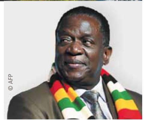
H.E. Emmerson Dambudzo Mnangagwa, President of the Republic of Zimbabwe