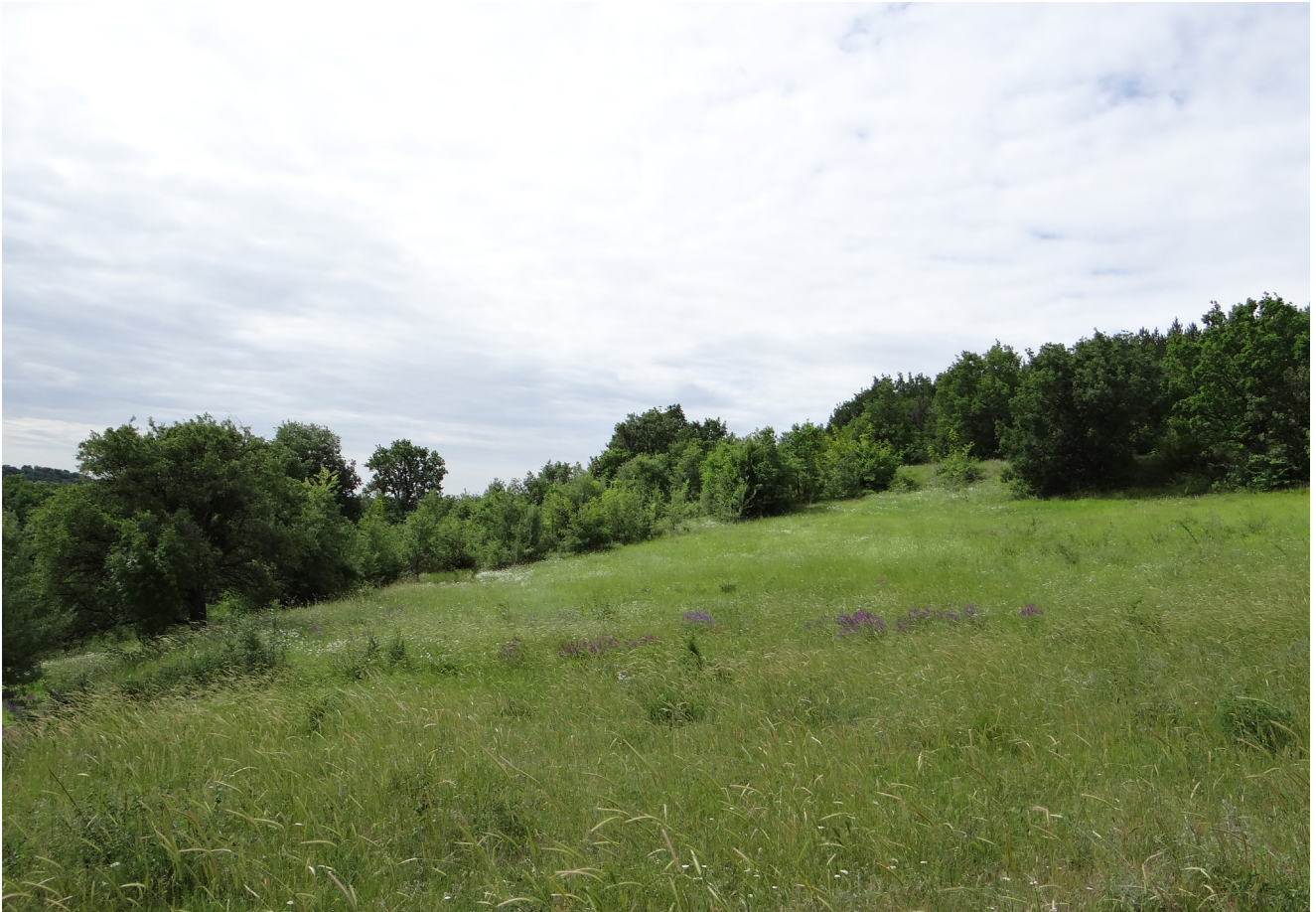
Fig. 3. Habitat of Myomimus roachi in the Sakar Mountain (UTM: MG33), SE Bulgaria.