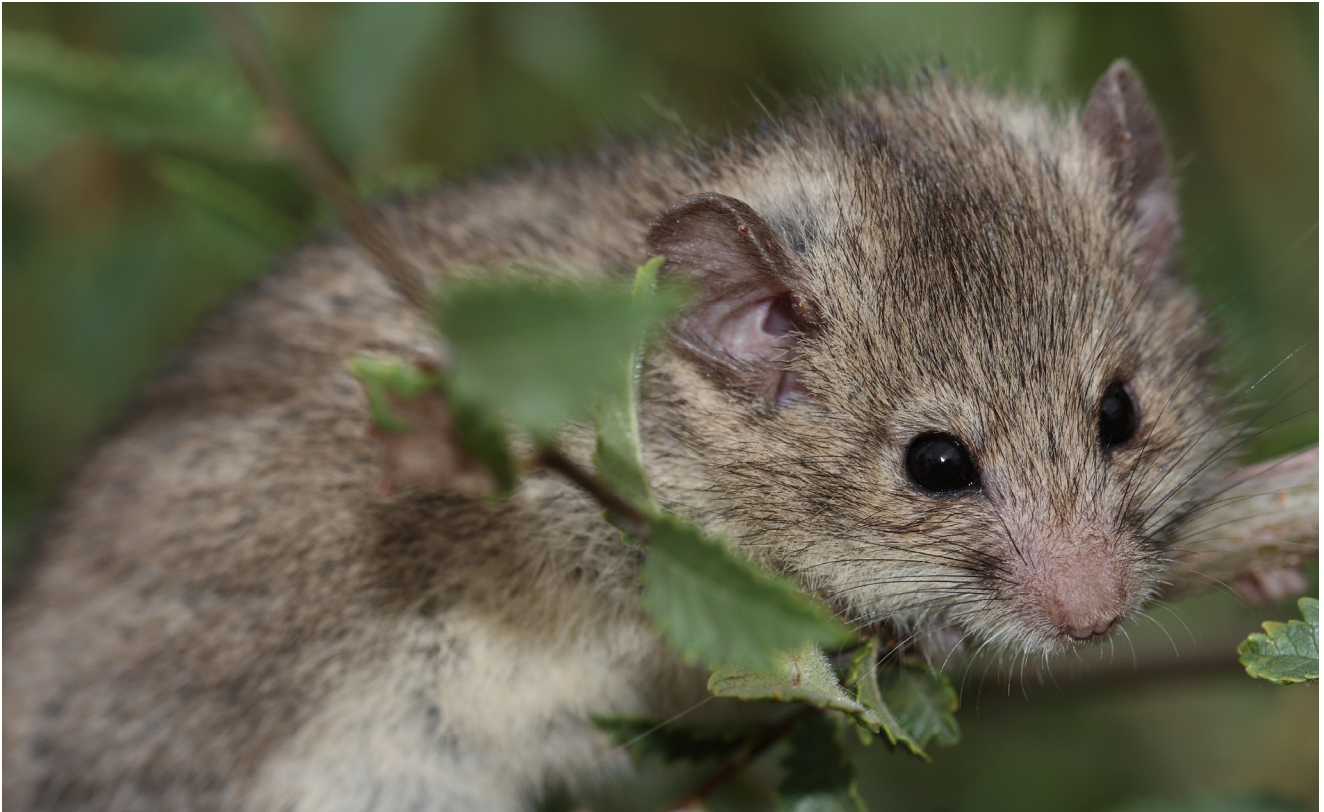
Fig. 2. Roach's mouse-tailed dormouse caught in 2017.

the current known distribution of the Roach's mouse-tailed dormouse.