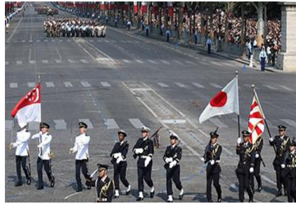
A parade in Paris in 2018 (a Ground Self-Defense Force unit with a Singaporean unit)