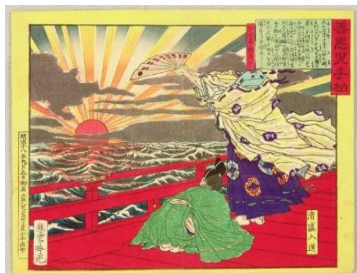
Priest Kiyomori, an old Kabuki story , by Ginko Adachi, 1885