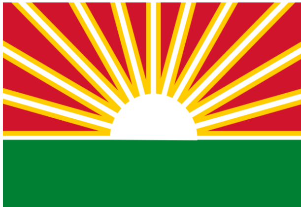
Flag of Lara State, Venezuela (1901-)