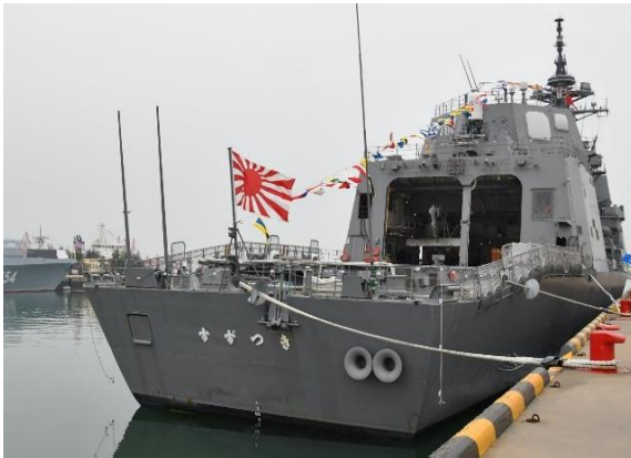
Naval event in Tsingtao 2019 (a Maritime Self-Defense Force vessel entering in Tsingtao port)

For more than half a century, these flags have been playing an indispensable role to show the presence of the Self-Defense Forces vessels and units, and are widely accepted in the international community.