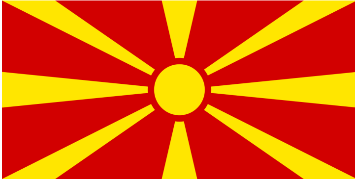
Flag of the Republic of North Macedonia (1995-)

The design of the rising sun with beams of lights is not unique to Japan. Similar designs are widely used in the world, as seen in the national flag of Republic of North Macedonia, the state flags of Arizona, the U.S. and Lara, Venezuela as well as the flag of the air force of Belarus.