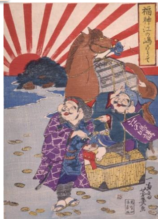
An ukiyoe print , Lucky gods Visit Enoshima Palace , by Yoshiiku Ochiai, 1869