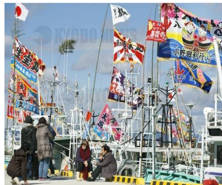
The return to Ukedo port (2017) of fishing boats that had evacuated due to the Great East Japan Earthquake