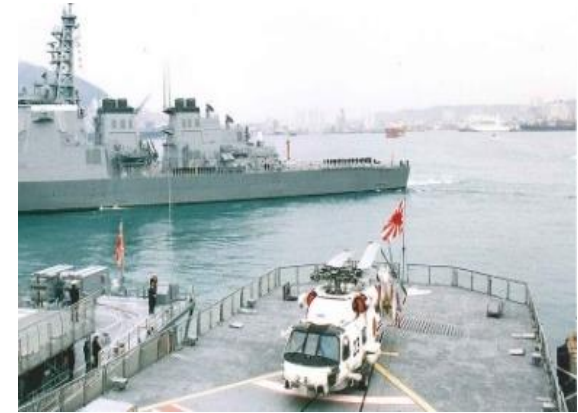
Naval event in Busan 1998 (a Maritime Self-Defense Force vessel entering in Busan port)