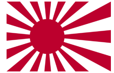
The flag of the Maritime Self-Defense Force

The flags of the Maritime Self-Defense Force and the Ground Self-Defense Force employ the design of the Rising Sun, in accordance with the Order for the Enforcement of the Self-Defense Forces Law in 1954.