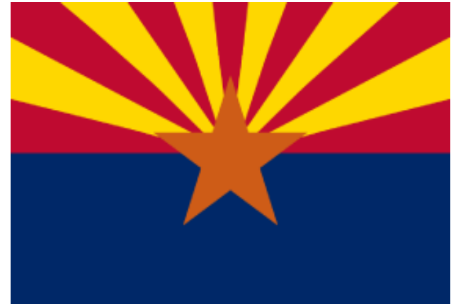
Flag of Arizona State, the U.S. (1917-)