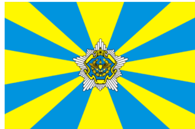
Flag of Belarus Air Force (2001-)