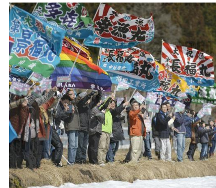
People celebrating the opening of the Hokkaido Shinkansen with big fishing flags, 2016