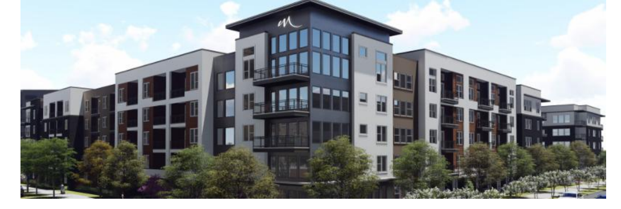
Mill Creek Modera Apartment Rendering