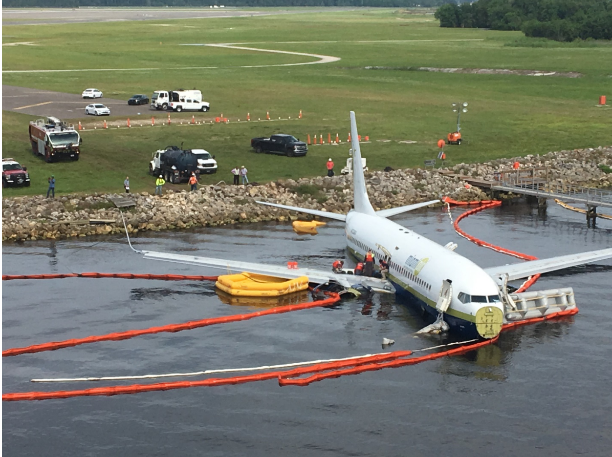
Figure 3. Closeup view of the airplane showing several rafts and door slides.

Runway 10 is 9,000-ft long and 200-ft wide and has a 1,000-ft displaced threshold. The runway also has a paved runway overrun area that is 1000-ft long. Investigators surveyed tire marks on and beyond runway 10, extending from the airplane's estimated touchdown point to the embankment along the river. Light, white, landing gear tire marks were found on the pavement beginning at the touchdown point of the airplane, about 1,600 feet from the runway 10 displaced threshold, and continuing to the end of the pavement. (The touchdown point based on the tire marks is consistent with the estimated touchdown point based on initial review of the flight data recorder [FDR] data.) The tire marks also showed that the airplane touched down about 20 ft right of the runway centerline, returned to the centerline within about 1,000 ft of touchdown, then veered about 75 ft right of the centerline by the time the airplane had traveled about 6,200 ft from the runway 10 displaced threshold (about 4,600 ft from touchdown). The airplane then departed the runway surface about 60 ft right of the centerline onto the grass before striking the rock embankment.