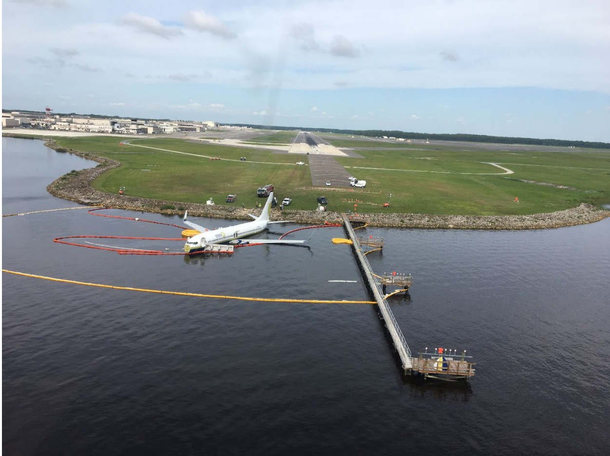
Figure 2. View looking west at the airplane and runway.

The two forward exits and the four overwing exits were used to evacuate passengers and crew from the airplane (see figure 3). The escape slide at the right forward door had deflated by the time the NTSB arrived on scene, and the escape slide at the left forward door was found fully inflated and attached to the airplane. Four rafts were deployed during the evacuation, and two sustained damage. Interviews with the flight and cabin crew have been conducted regarding the landing and evacuation.