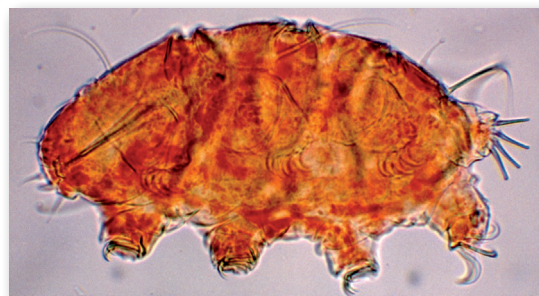
Figure 1. Fresh specimen of Echiniscus granulatus (Tardigrada) showing the natural orange colouration of this species. The animal's body length is 350 \mu\text{m} .

Latent or dormant states are quite common in the