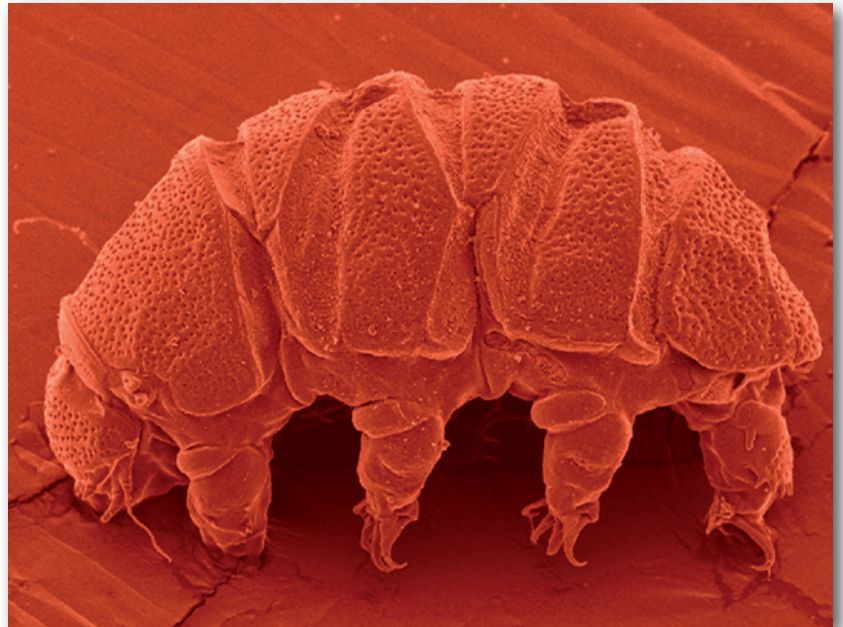
Figure 2. Echiniscus madonnae scanning electron photomicrograph.

The adult animals are not the only focus of interest in tardigrade biology. The complexity of tardigrade egg shells is presumed to be a factor in their survival (Figure 3). The function of the elaborate ornamentation that is a feature of the eggs of so many species is not really understood, but a number of hypotheses have been suggested 1 . The projections on the surface may help maintain the egg's position within an unstable substratum or they may