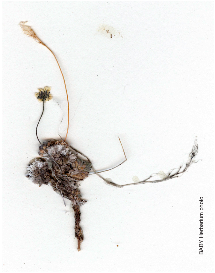
BABY Herbarium photo

Distinguishing features: Most closely resembles D. porsildii , it differs by having soft, crisped trichomes throughout, pubescent pedicels and distal parts of stems, obovate petals ca. 1.8 × 0.8 mm, elliptic fruits 3.5–4.5 × 1.5–1.8 mm, obsolete styles, flattened and strongly 2-lobed decurrent stigmas, and ca. 24 seeds and aborted ovules per fruit. By contrast, D. porsildii has stiff, non-crisped trichomes, glabrous pedicels and distal parts of stem, ovate to oblong fruits 4–7.5 × 1.7–3 mm, style 0.1–0.3(–0.5) mm, entire to slightly 2-lobed nondecurrent stigmas, and 12–16 seeds and aborted ovules per fruit. 1.5–1.8 mm, obsolete styles, flattened and strongly 2-lobed decurrent stigmas, and ca. 24 seeds and aborted ovules per fruit. By contrast, D. porsildii has stiff, non-crisped trichomes, glabrous pedicels and distal parts of stem, ovate to oblong fruits 4–7.5 × 1.7–3 mm, style 0.1–0.3(–0.5) mm, entire to slightly 2-lobed nondecurrent stigmas, and 12–16 seeds and aborted ovules per fruit.