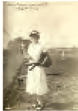
Helen Wills (USA)

Unhappy at the relatively poor treatment of its sport over several Olympic Games, the International Lawn Tennis Federation (as it was known until 1977) suggested to the International Olympic Committee that it should be granted at least one representative on the IOC; be allowed to co-operate in the technical and material organisation of tennis at the Games; and requested that the IOC drop its demand for Wimbledon not to be held in any Olympic year. When the IOC refused to recognise any of the requests, the ILTF had little option but to withdraw tennis from Olympic competition.