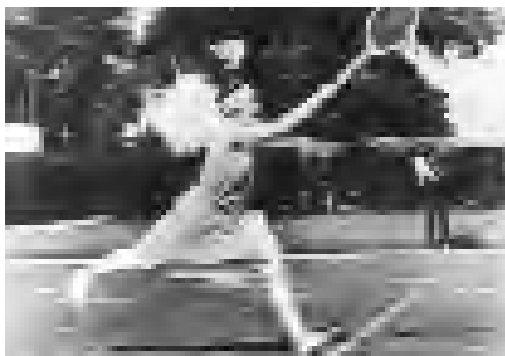
Suzanne Lenglen (FRA)

Perhaps unsurprisingly given the travelling difficulties of the time, few European players travelled to the 1904