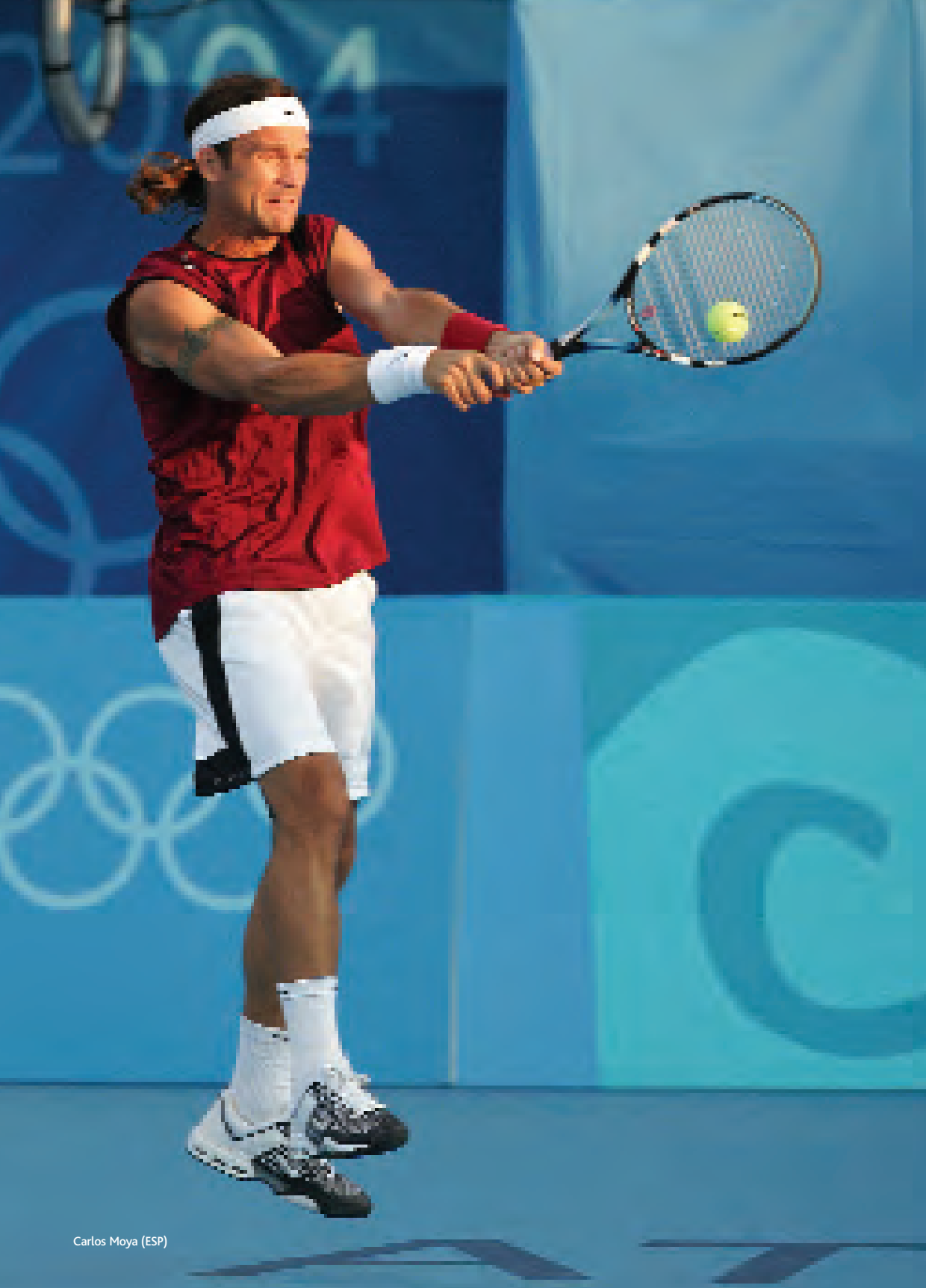
Carlos Moya (ESP)