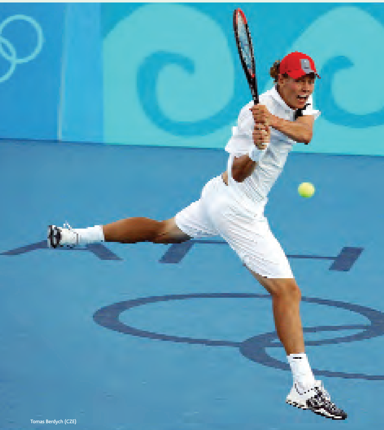
Tomas Berdych (CZE)