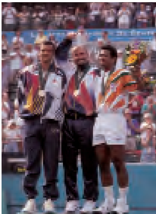
1996 Olympics, left to right, Sergio Bruguera (ESP), Andre Agassi (USA), Leander Paes (IND)