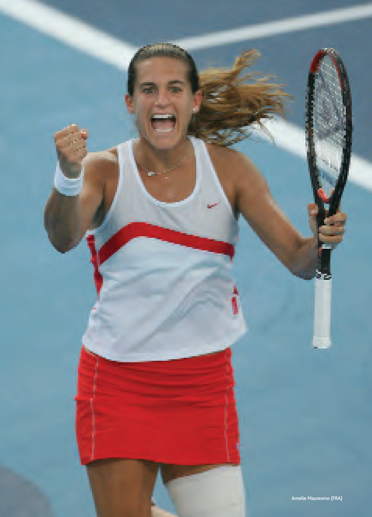
Amelie Mauresmo (FRA)