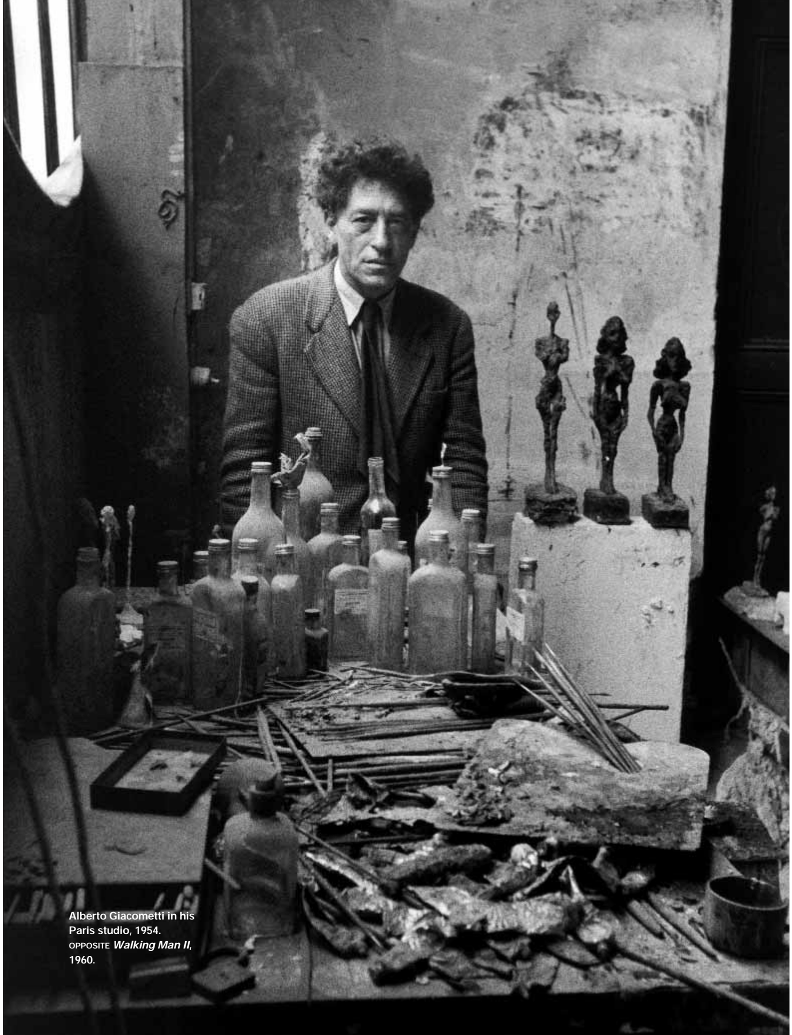
Alberto Giacometti in his Paris studio, 1954. OPPOSITE Walking Man II , 1960.