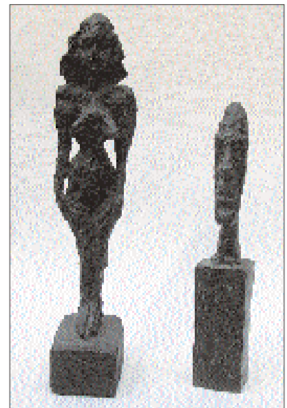
Two forged "Giacometti" bronzes seized in 1973.