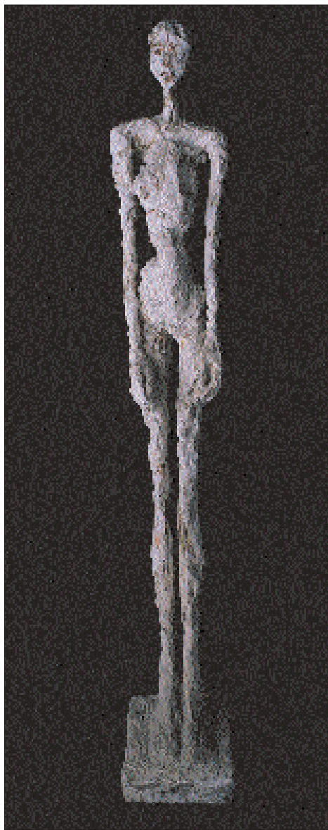
The foundation owns the original plaster for Standing Woman , ca. 1958.